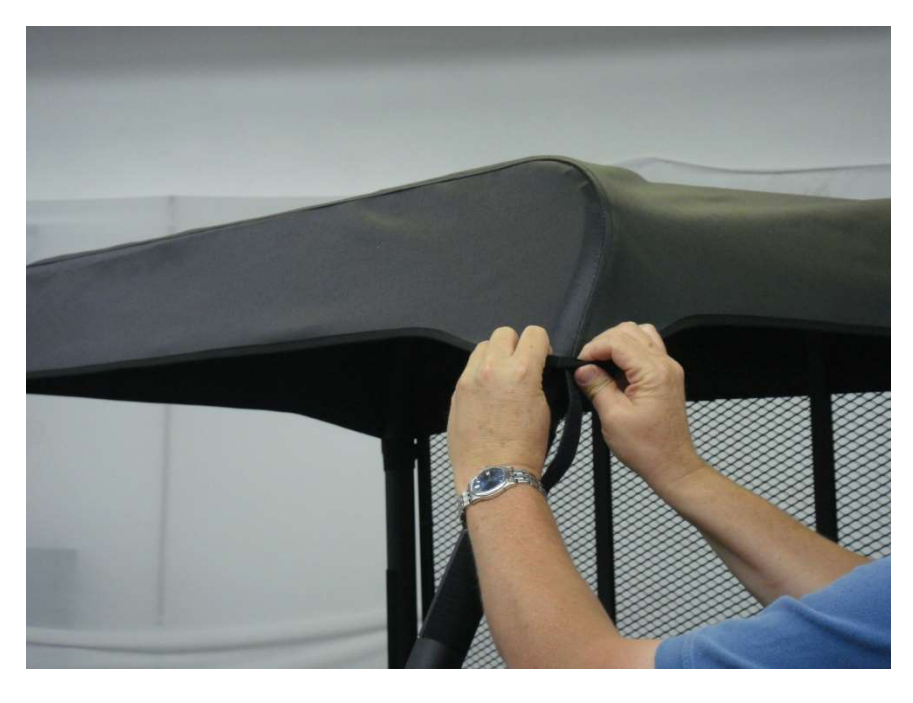
Figure 5.2 - Pull down firmly and attach front Velcro Tabs to installed Velcro strips