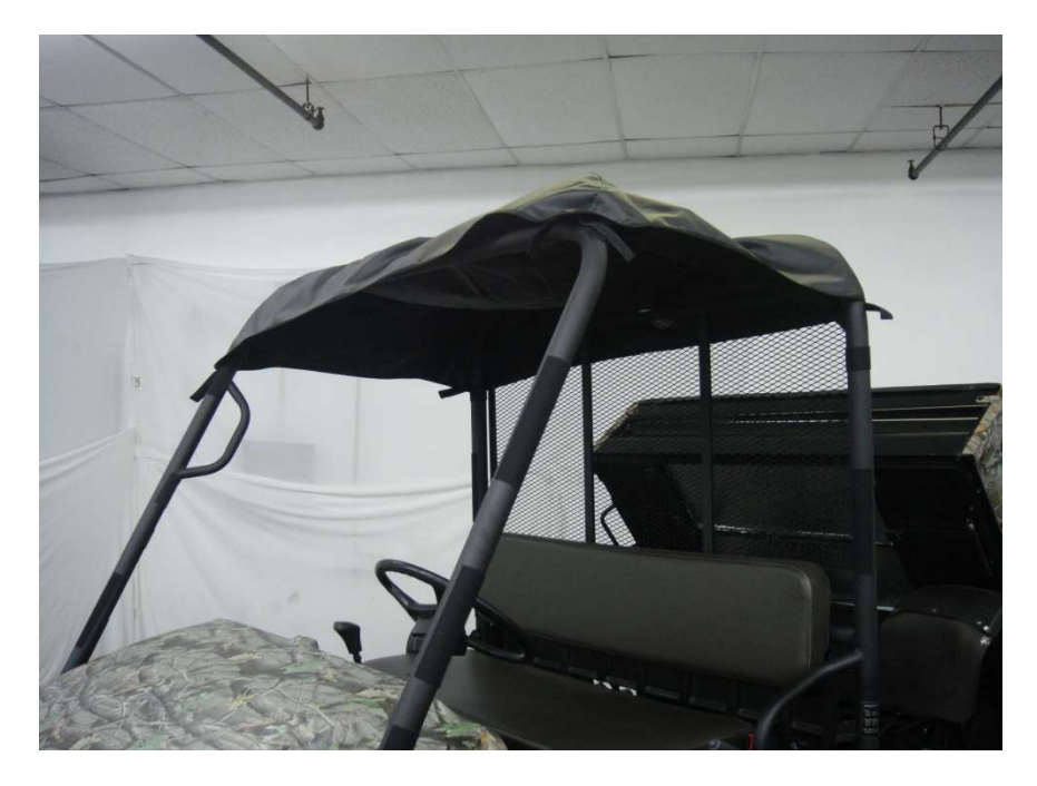
Step 4: Place Kawasaki Mule 4010 Top Cap on top of the vehicle roll bar as shown in figure 4.1.