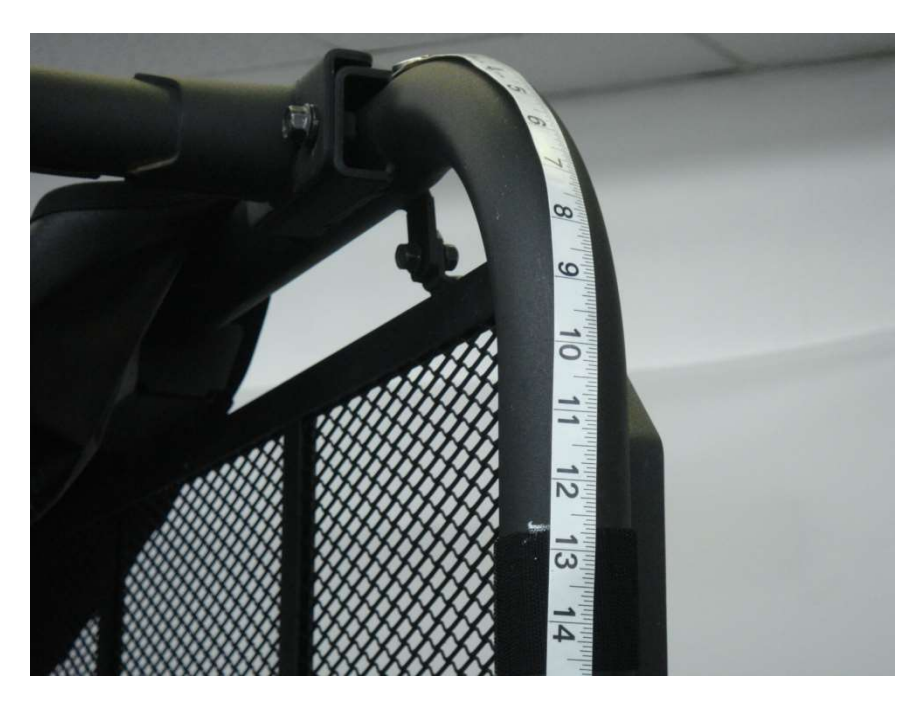
Figure 3.1 – Place Rear Velcro strips 12 ¾" inches below the top roll bar cross member brackets located at the top of the Cab Roll Bar Structure

Step 3: Remove the clear plastic backing from the Velcro strip and fasten 6 " Velcro Strips around each of the Rear roll bar frame posts 12 %" inches below the top roll bar cross member brackets as shown in figure 3.1. Note: Velcro should make a complete circle around the roll bar placing the Velcro Seam toward the interior of the cab. Repeat both sides of vehicle.