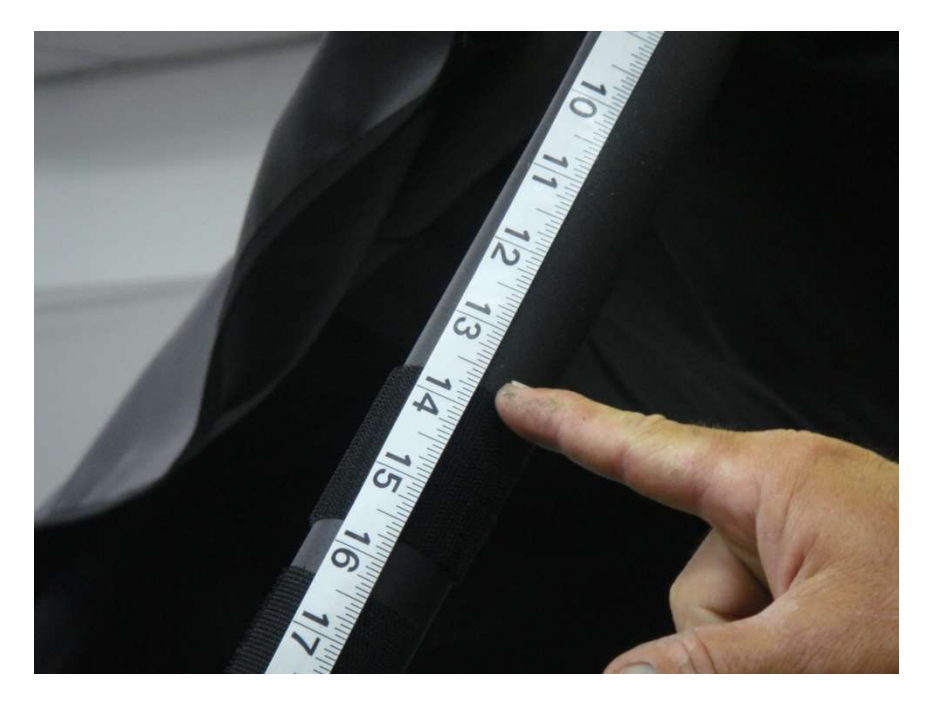
Figure 2.1 - place front Velcro strips horizontally around the front roll bar posts 13 ¾" below the roll bar cross member bracket located at the top of the cab roll bar structure.

Step 2: Remove the clear plastic backing from the Velcro strip and fasten 6 " Velcro Strips horizontally around each of the front roll bar frame posts 13 % inches below the top roll bar cross-member bracket as shown in figure 2.1 . Note: Velcro should make a complete circle around the roll bar placing the Velcro Seam toward the cab interior. Repeat both sides of vehicle.