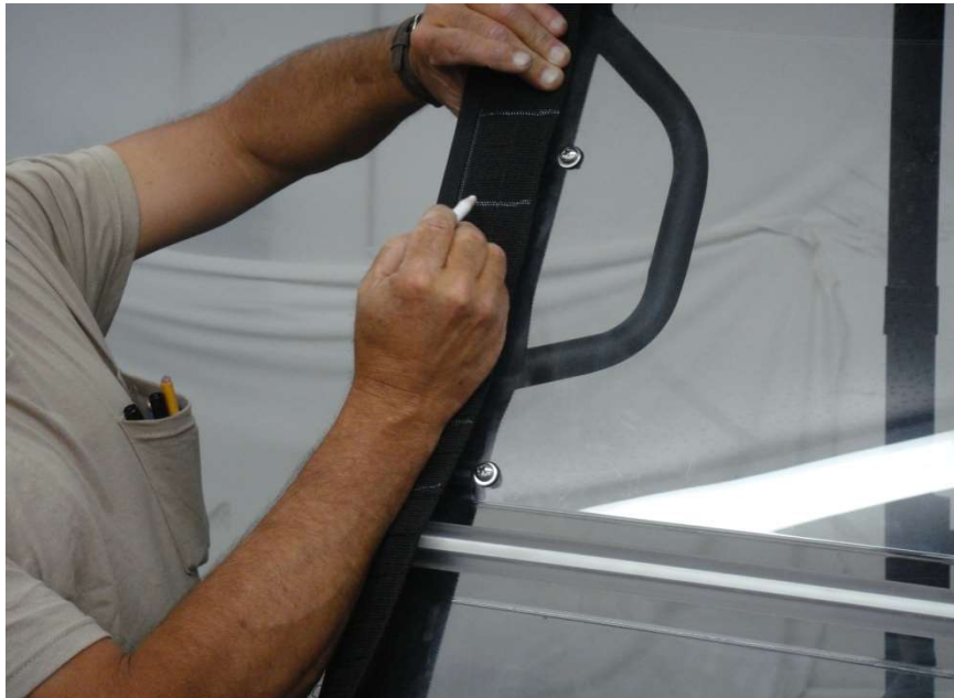
Mark the Windshield Velcro Tabs for hard windshield Clamp locations