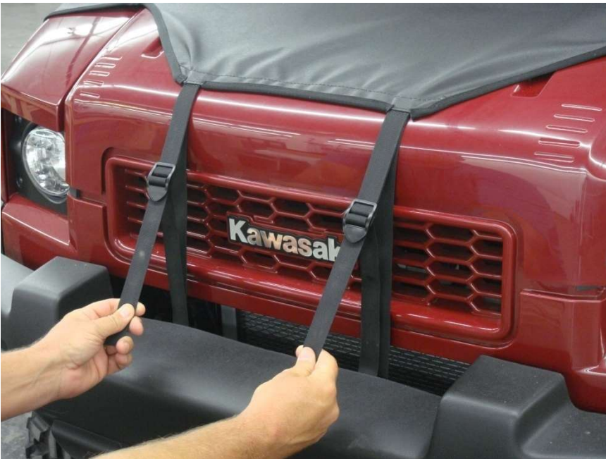
Figure 10.1 - tighten front hood straps until front windshields wrinkles are straightened out

Step 10: Tighten Front Hood Straps by pulling downward from the buckle on both strap ends at the same time as shown in figure 10.1