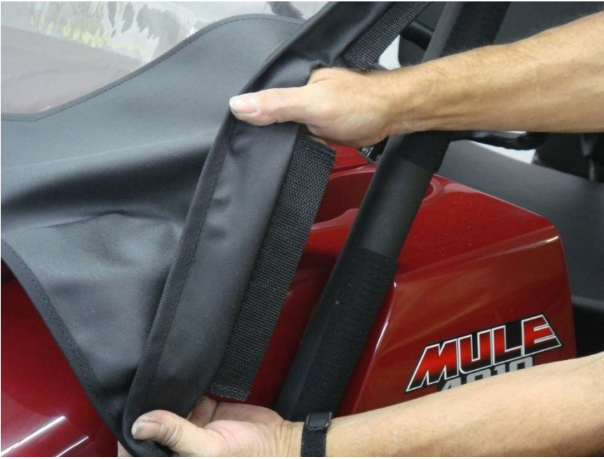
Figure 9.3 - attach bottom 8" Velcro Tabs to the installed Velcro Strips

Step 10: Tighten Front Hood Straps by pulling downward from the buckle on both strap ends at the same time as shown in figure 10.1