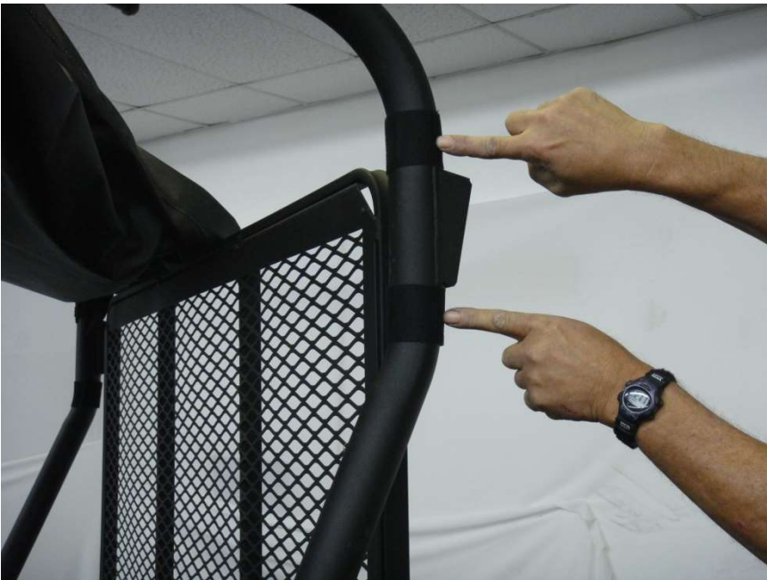
Figure 4.2 - Install 6" Velcro strips above and below the upright roll bar exhaust port