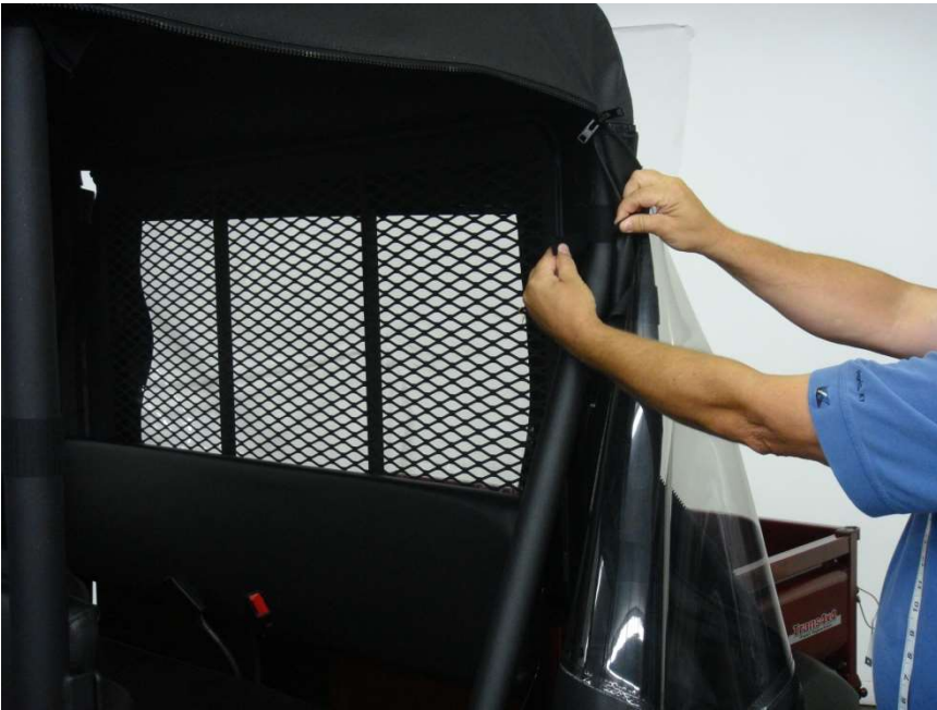
Figure 7.1 - attach 6" Rear Roll Bar post enclosure Velcro tabs to installed Velcro strips above and below the Roll bar exhaust port

Step 7: Pulling upward & outward on the 6" Rear Roll Bar Post Enclosure Velcro Tabs, attach Rear and Center Roll Bar upright Post Enclosure tabs to installed 6" Velcro Strips by wrapping the taps around the Roll Bar and the installed Velcro strips as shown in figure 7.1 and 7.2 - Repeat both sides.