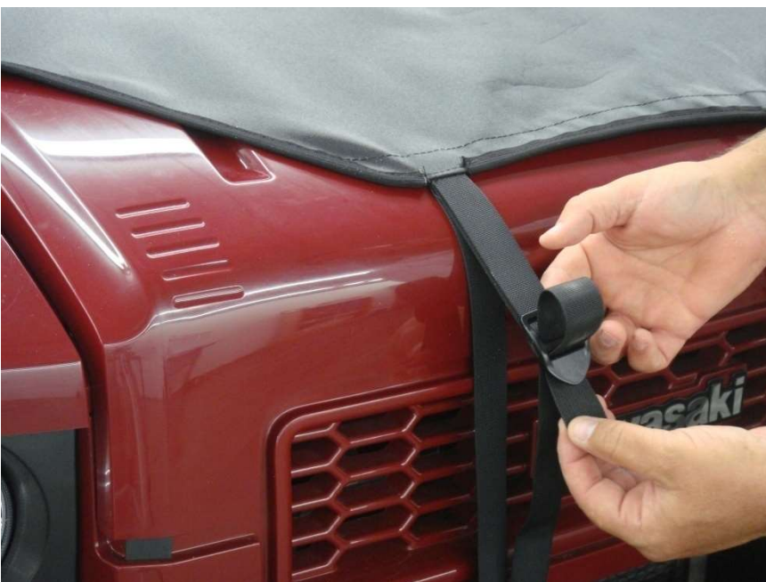
Figure 8.2 - Thread front Hood Strap into the buckles starting upward through the back of the buckle through the top opening