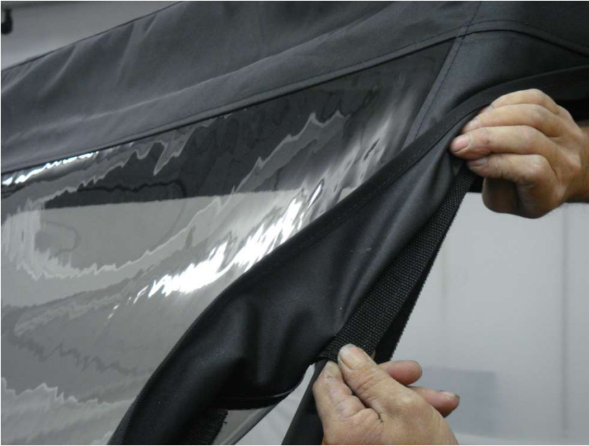
Figure 9.1 - attach top 8" Velcro Tabs to installed Velcro strips

Step 9: Starting with the top Front Roll Bar Post Enclosure tabs pull outward and downward attaching tabs to 8" inch Velcro Strips on the Front Windshield Roll Bar Uprights as shown in figure 9.1. Repeat this process with the Center and Bottom Front Roll Bar Enclosure Tabs as shown in figure 9.2 and 9.3 making sure that the Vinyl Windshield is centered between the Roll Bar posts. This step is best performed attaching both sides simultaneously.