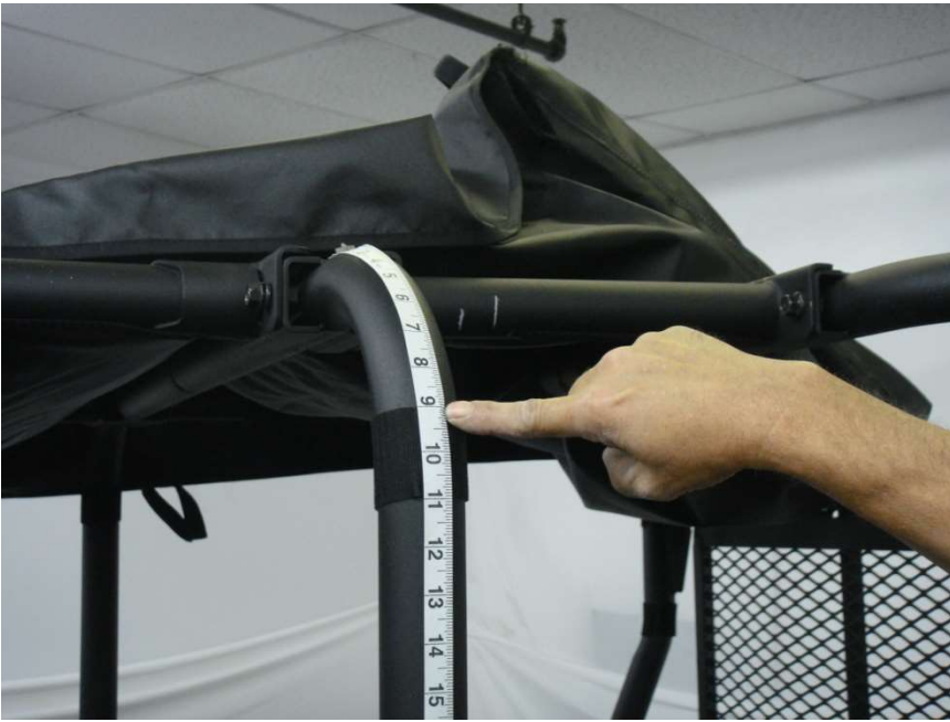
Figure 4.1 – install 6" Velcro strip horizontally around the Center Roll Bar upright 9" below the cross-member weld joint

Step 4: Remove the clear plastic backing from the 6" Velcro strips and install horizontally around the Center and Rear Roll Bar Uprights as shown in figures 4.1, 4.2 and 4.3 - Repeat both sides . Note: Velcro strips should go around the Roll Bar posts with the seam facing toward the inside of the Cab.