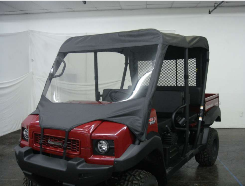
Figure 11.1 - repeat steps 7, 9 and 10 until the cab enclosure and windows are tight

Step 11: Repeat Steps 7, 9 and 10 until the Enclosure fits snugly to the Vehicle Roll Bar structure and front and rear windows are tight as shown in figure 11.1.