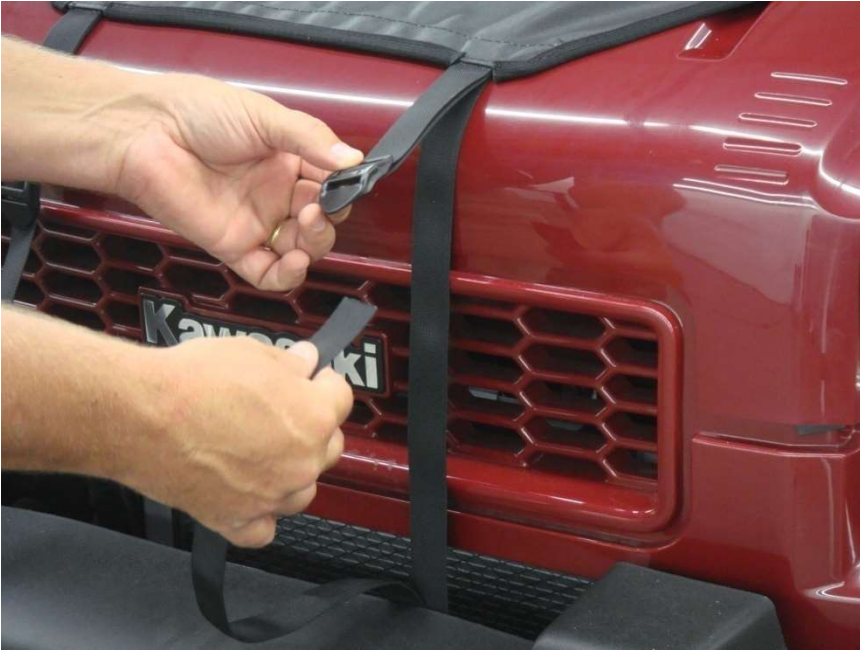
Figure 8.1 - Run Front Hood Straps around the Vehicle front bumper bar located behind the plastic Bumper Guard

Step 8: Fasten pre-attached Enclosure Front Hood Straps to the Vehicle front bumper bar behind the plastic Bumper Guard as shown in figure 8.1. Bringing the end of the straps up to the latch buckle, run the end through the back of the top buckle opening first and then through the front of the lower buckle opening as shown in figure 8.2. DO NOT FULLY TIGHTEN FRONT HOOD STRAPS AT THIS TIME.