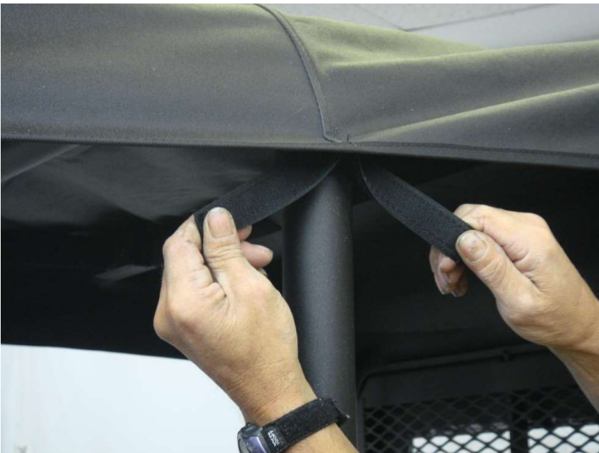
Figure 7.2 - attach 6" Center Roll Bar post enclosure Velcro Tabs to installed Velcro Strips