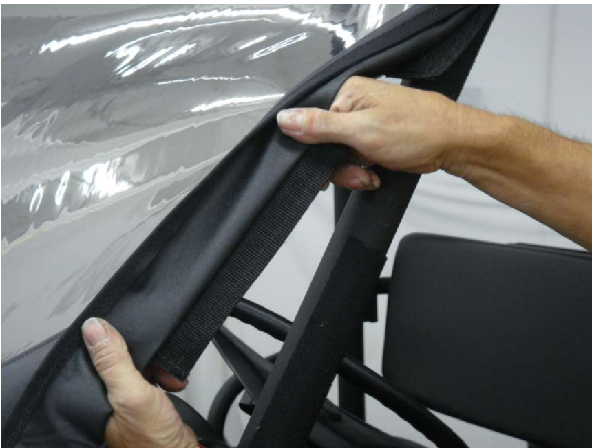
Figure 9.2 - Attach center 8" Velcro Tabs to installed Velcro strips