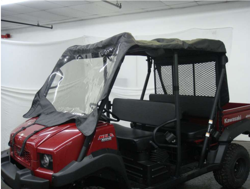
Figure 5.1 - place cab on top of vehicle cab roll bar and align seams to the center of corner roll bar tubes

Step 5: Place the enclosure on the Roll Bar Cab Frame as shown in Figure 5.1. With the Enclosure on top of the Roll Bar Cab Frame adjust the enclosure so that seams are located near the center of the Roll Bars. The vehicle bed will need to be raised for this step and subsequent installation steps.