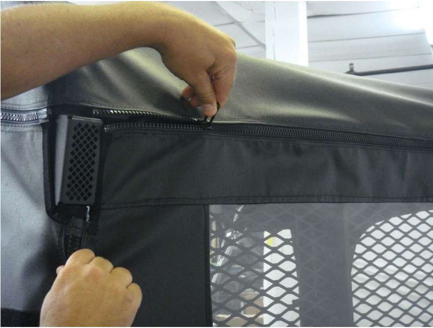
Figure 7.2B – attach Rear Window Panel by zipping it to the Top and Door Panels. Note Rear Roll Bar Exhaust port must be exposed