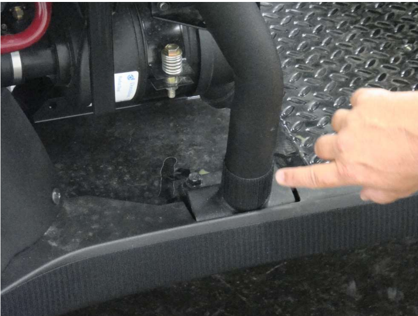
Figure 4.5 – install 6 1/2” Velcro Strip horizontally around the bottom of the Rear Roll Bar upright