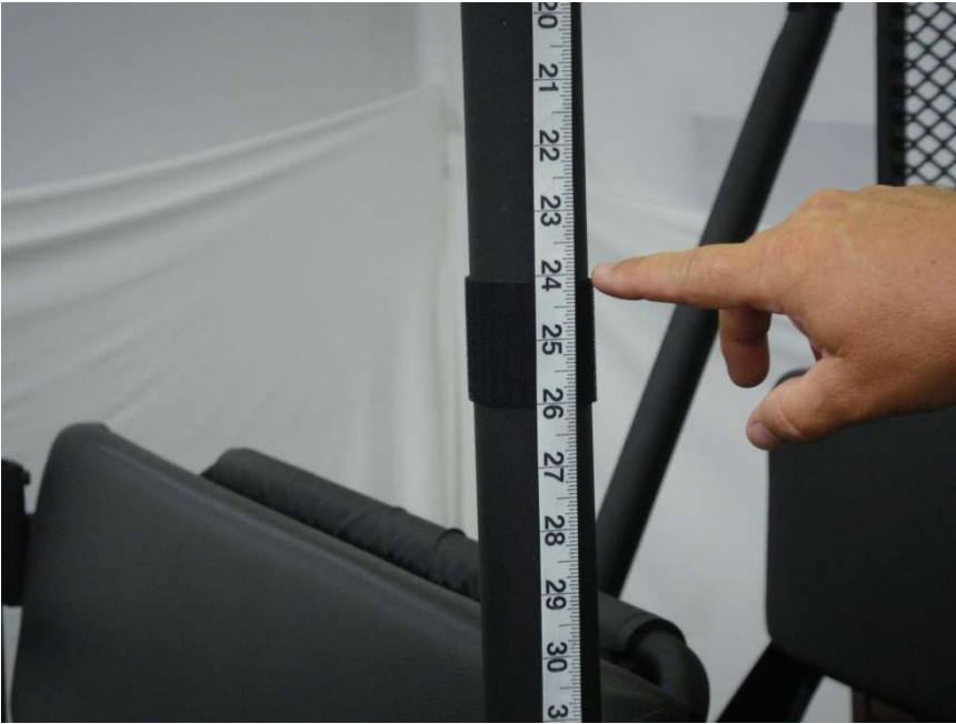
Figure 4.2 – install 6 1/2" Velcro Strip horizontally around the Center Roll Bar upright 24" below the cross-member weld joint