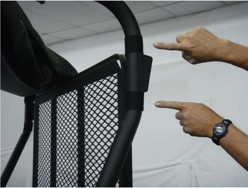
Figure 4.4 – install two 6 ½” Velcro strips horizontally at the top and bottom of the rear Roll Bar upright exhaust port