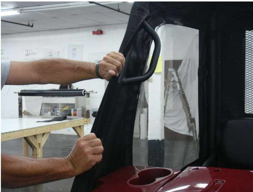
Figure 11.1 – attach Windshield Roll Bar post Velcro Tabs to installed 40" Velcro Strips

Step 11: Attach the Windshield Roll Bar Post Enclosure tabs to the installed 40" Velcro Strips as shown in figure 11.1. Your hard windshield will be placed over these tabs. Note: If Tabs interfere with your hard windshield clamp locations you will need to cut out 2" sections of the tab using household scissors being careful not to cut the binding and searing frayed fabric ends as shown in figure 11.2, 11.3 and 11.4.