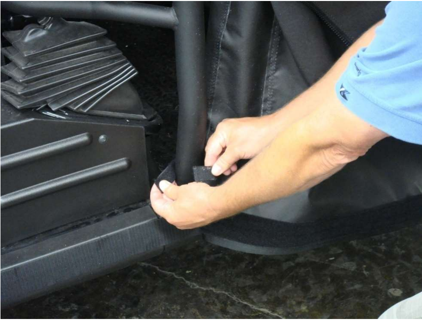
Figure 9.2 - attach 6 1/2" Rear Roll Bar Post enclosure Velcro tabs to the installed Velcro strips at the bottom of the Rear Roll Bar post upright

Step 10: Attach Center Roll Bar upright Post Enclosure tabs to installed 6 1/2" Velcro Strips by wrapping the tabs around the Roll Bar and the installed Velcro strips as shown in figure 10.1 and 10.2