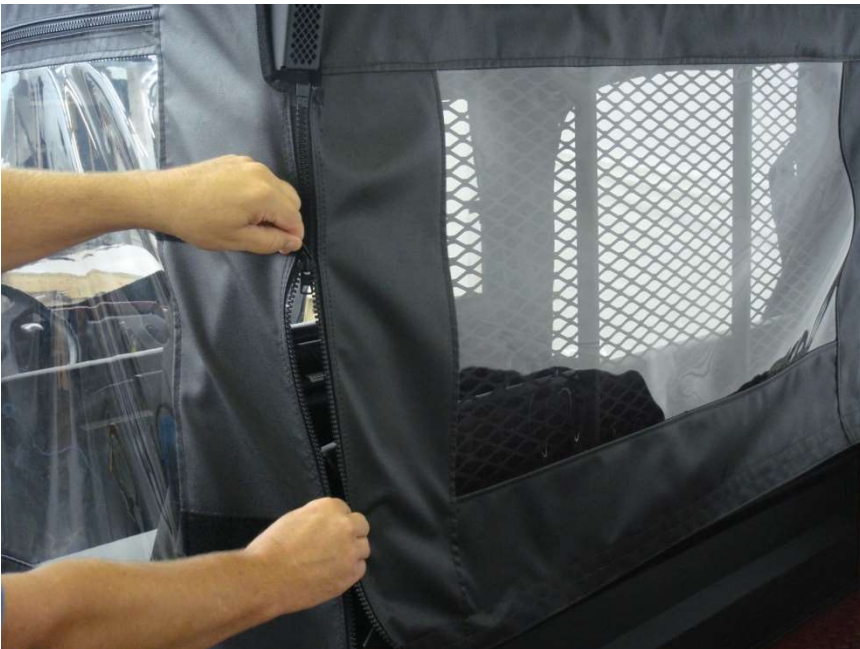
Figure 7.2A - attach Rear Window Panel by zipping it to the Top and Door Panels. Note Rear Roll Bar Exhaust port must be exposed