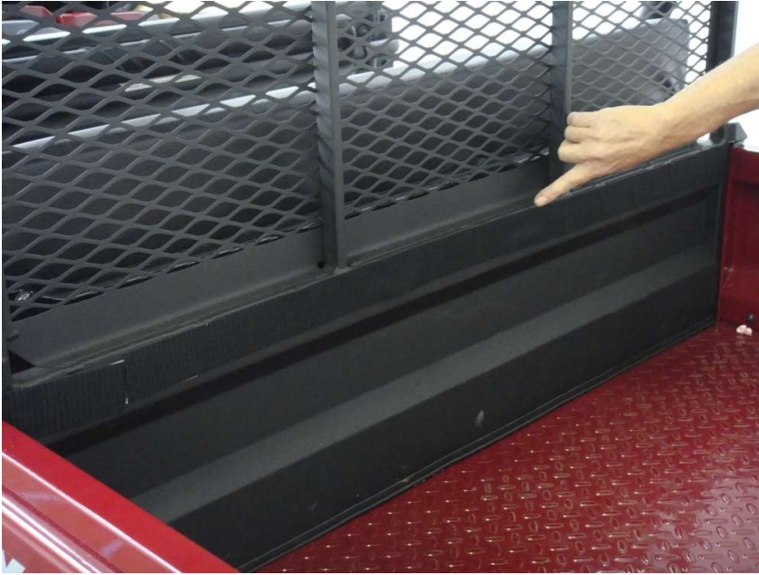
Figure 2.1 - install 47" Velcro Strip on Top Raised Panel below rear window

Step 2: Remove the clear plastic backing from the 47" Velcro strip and adhere to the top raised panel below the Rear Cab Window as shown in figure 2.1