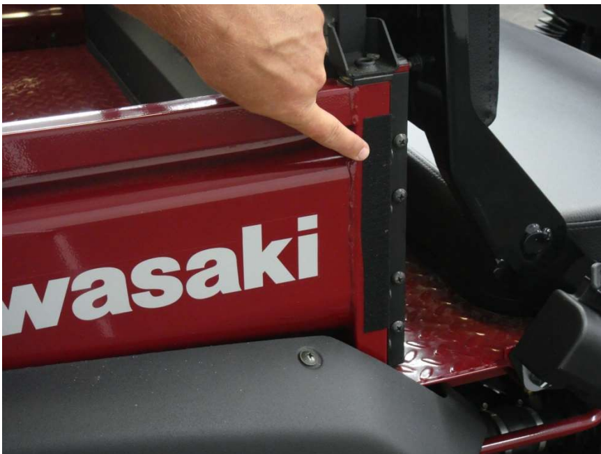
Figure 6.1 – install 14" (1" wide) Velcro Strips vertically to the Cargo Bed

Step 6: Remove the clear plastic backing from the 14" (1" wide) Velcro strips and adhere vertically to the Cargo Bed at the Rear Door area as shown in figure 6.1