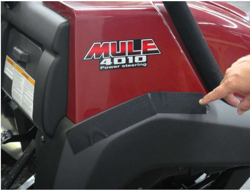
Figure 5.1 - Install the 14" Velcro Strips on the Dash Cowl / Fender Well – you will need to split the Velcro strip 9" X 5" before installing

Step 5: Remove the clear plastic backing from the 14" Velcro strips and adhere to the side of the Dash Cowl / Fender Well as shown in figure 5.1. Note: you will need to split the 14" Velcro strip so that one side is 9" and the other side 5" - this will allow you to follow the curve in the fender well.