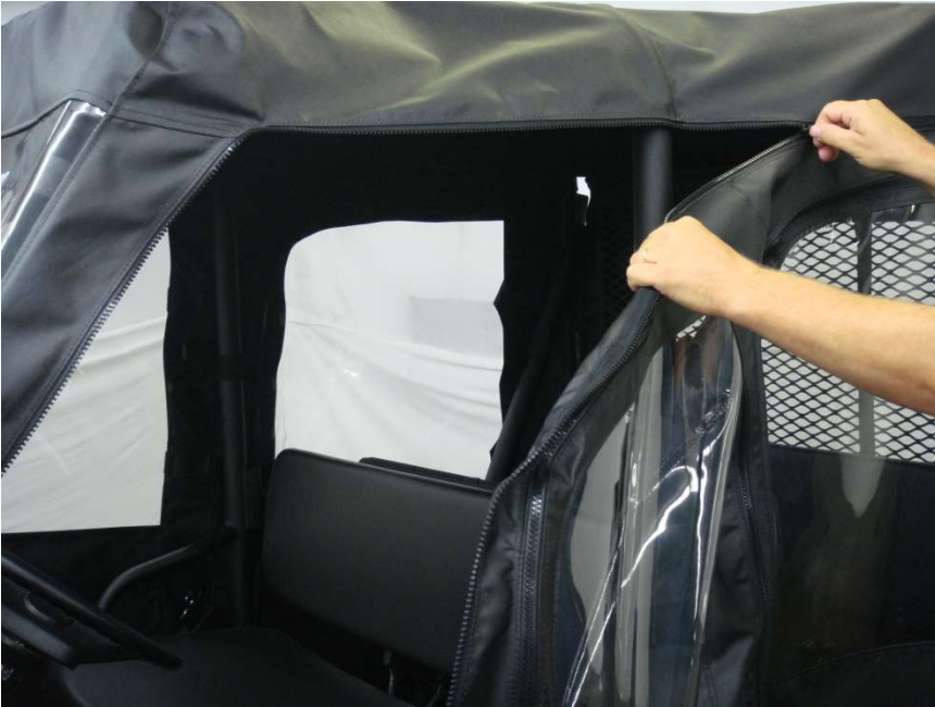
Figure 7.1 - Attach Door Panels by zipping them to the Top / Front Windshield panels

Step 7: Place the Windshield and Top portion of the enclosure on the Roll Bar Cab Frame and Zip the Door Panels and Rear Window Panel to it as shown in Figure 7.1 and 7.2. With the Full Cab Enclosure on top of the Roll Bar Cab Frame as shown in figure 7.3 adjust the enclosure so that seams are located near the center of the Roll Bars. The vehicle bed will need to be raised for this installation step.