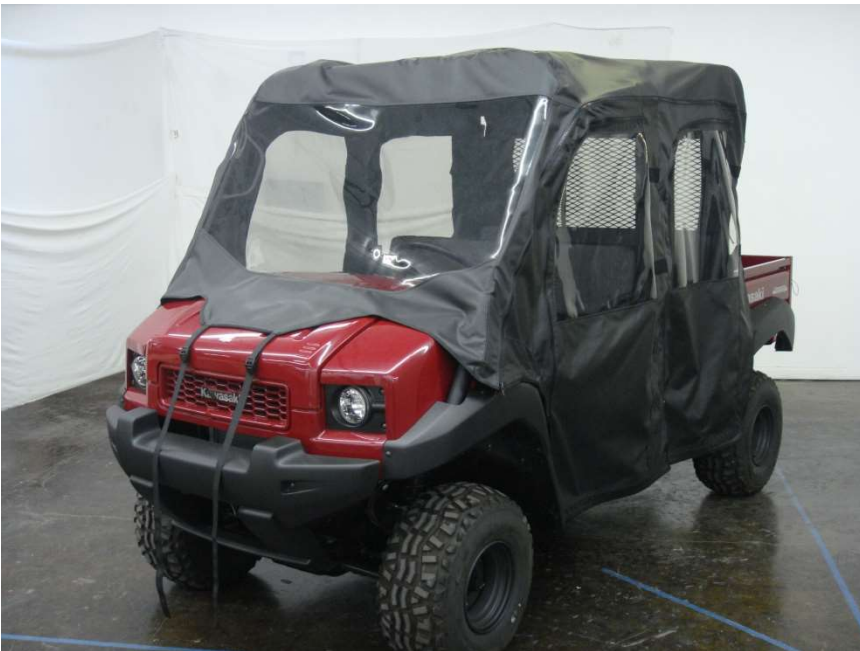
Figure 7.3 - align enclosure with all panels attached on the Roll Cab Frame so corner Enclosure seams are located near the center of the roll bars

Step 8: Begin attaching Enclosure by first squaring the back of the Enclosure to the Rear of the Cab frame and attaching the Rear Cab Window bottom Velcro tab to the installed 47" Velcro strip as shown in figure 8.1.