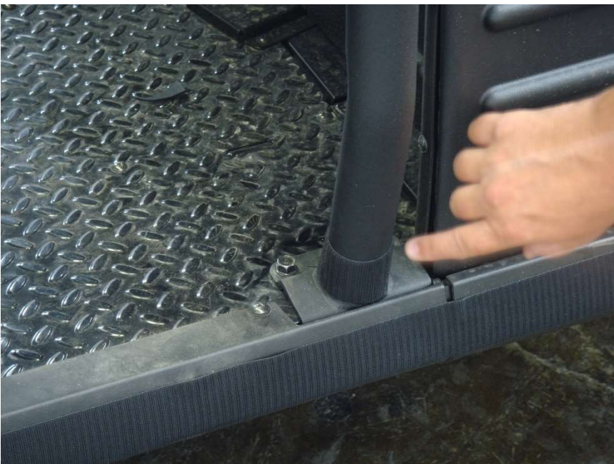
Figure 4.1 – install 6 1/2" Velcro Strip horizontally around the bottom of the Center Roll Bar upright

Step 4: Remove the clear plastic backing from the 6 1/2" Velcro strips and install horizontally around the Center and Rear Roll Bar Uprights as shown in figures 4.1, 4.2, 4.3, 4.4 and 4.5. Also, attach the 2-30" adhesive Velcro strips along the rocker panel at the bottom of the front doors. Note: Velcro strips should go around the Roll Bar posts with the seam facing toward the inside of the Cab.