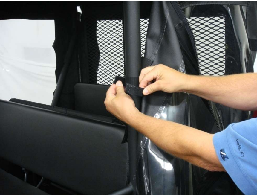
Figure 10.1 - attach Center Roll Bar upright enclosure tabs to installed 6 1/2" Velcro strips at the center and top of the Roll Bar Upright

Step 10: Attach Center Roll Bar upright Post Enclosure tabs to installed 6 1/2" Velcro Strips by wrapping the tabs around the Roll Bar and the installed Velcro strips as shown in figure 10.1 and 10.2