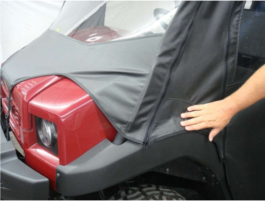
Figure 12.2 - attach Dash Cowl / Fender Well Side Velcro Tabs to installed Velcro strips

Step 13: Repeat Steps 9, 10, 11 and 12 until the Enclosure fits snug to the Vehicle Roll Bar structure and windows are tight.