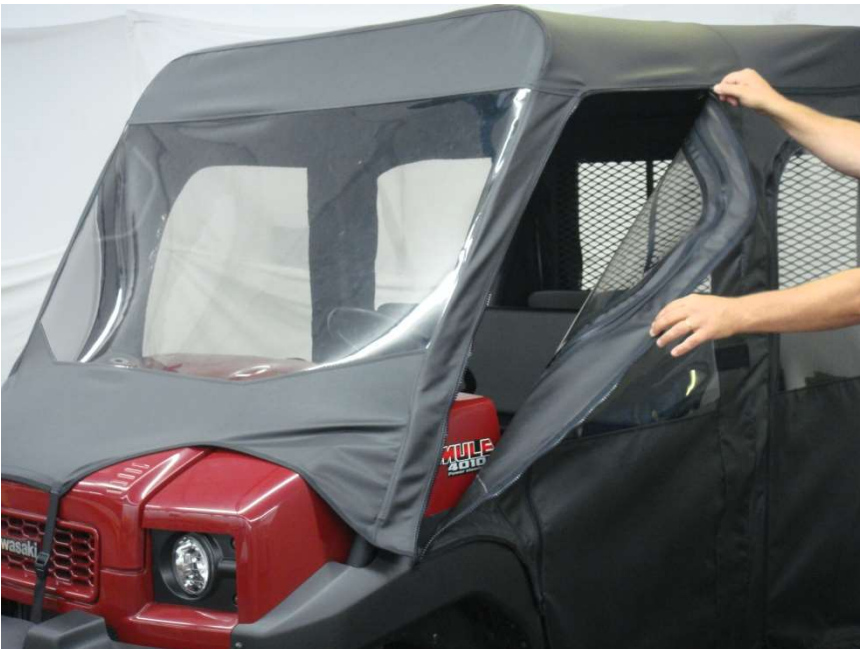
Figure 12.1 - Zip Side Door panels closed

Step 12: Zip Doors closed and attach Dash Cowl side tabs to respective Velcro Strips as shown in figure 12.1 and 12.2.