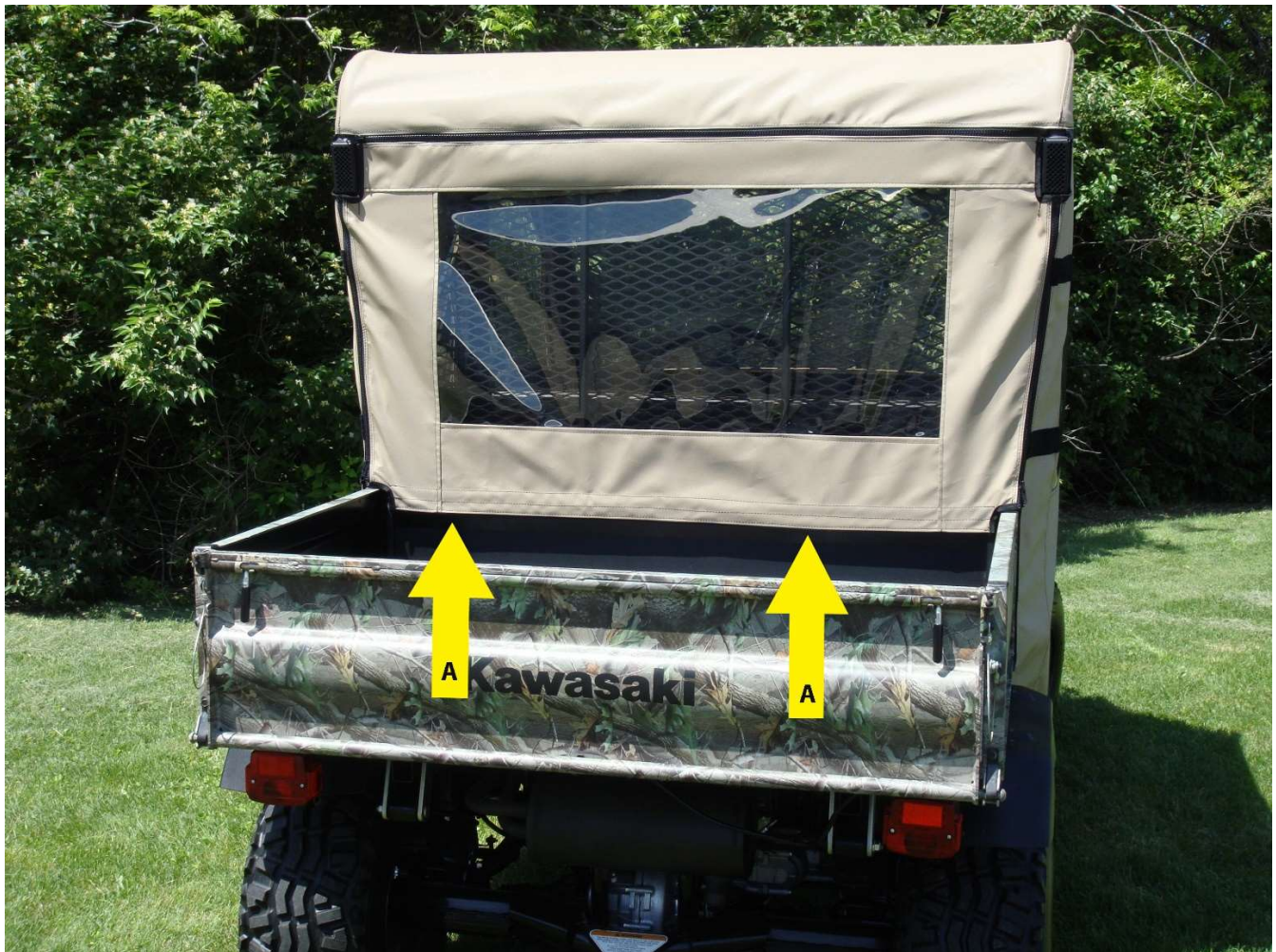
Figure A - install 47" Velcro Strip on Top Raised Panel below rear window