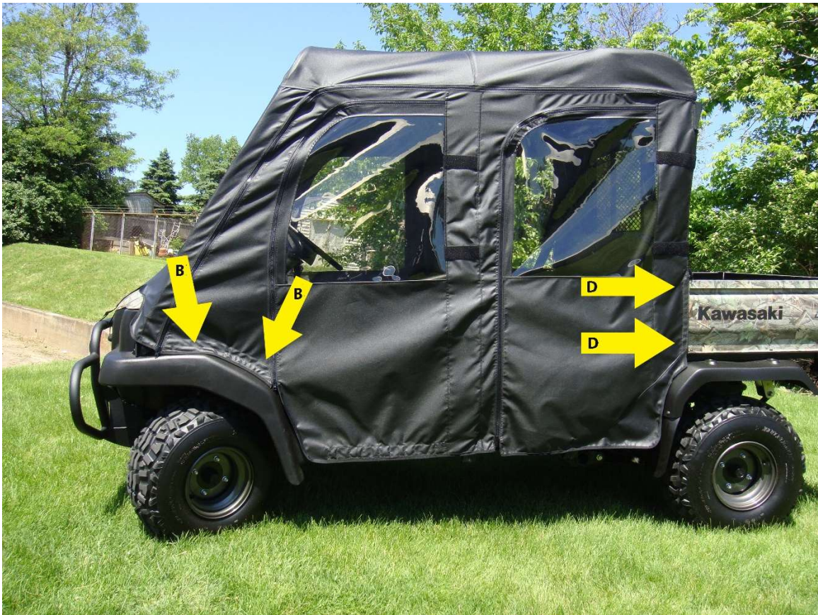
Figure B – install Velcro along fender and front side of cargo bed.