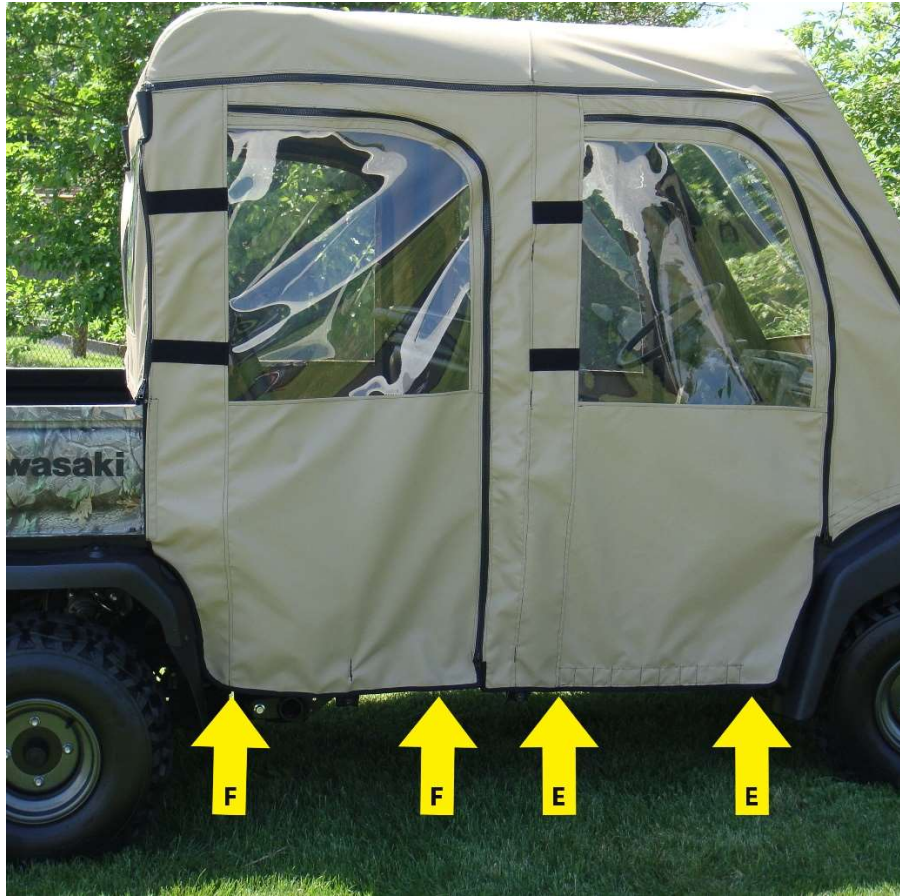
Figure D – hook is placed horizontally along the bottom roll bar.