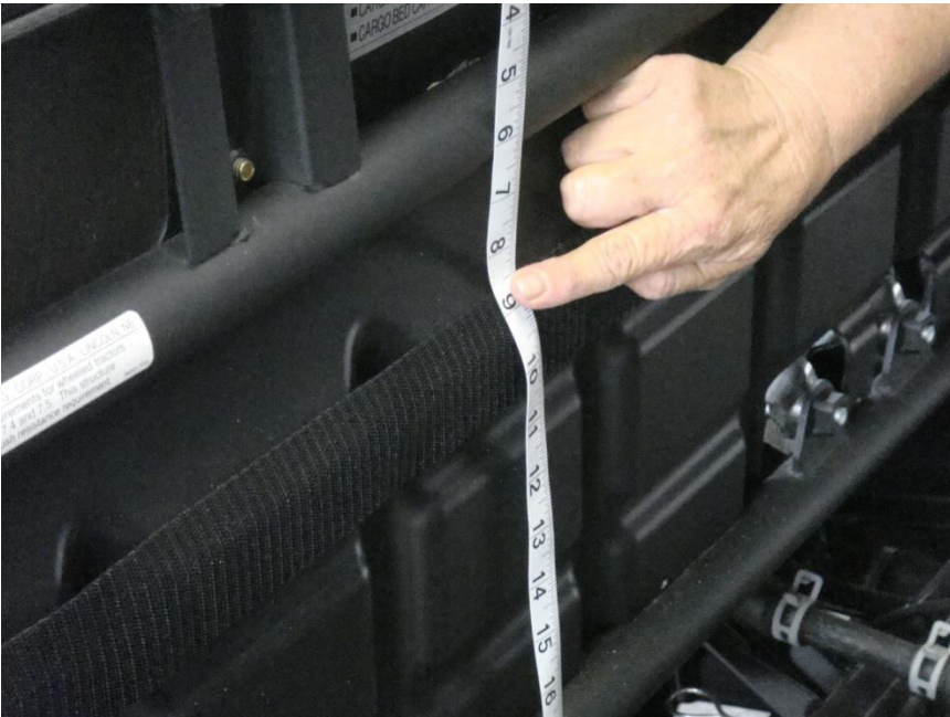
Figure 4.1 - 49" Velcro Strip Placed 9" below the top of the cab rear guard on the upper raised rib

Step 4: Remove the clear plastic backing from the 49" Velcro strip and adhere to the rear cab guard 9" below the bottom of the rear cab window frame on the upper raised guard rib as shown in figure 4.1. Note you will need to raise the vehicle bed to perform this installation step