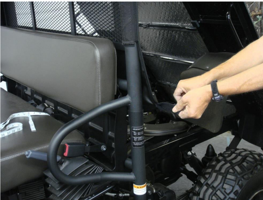
Figure 7.2 - attach Rear Roll Bar Post Velcro Tabs around Roll Bar just below the armrest