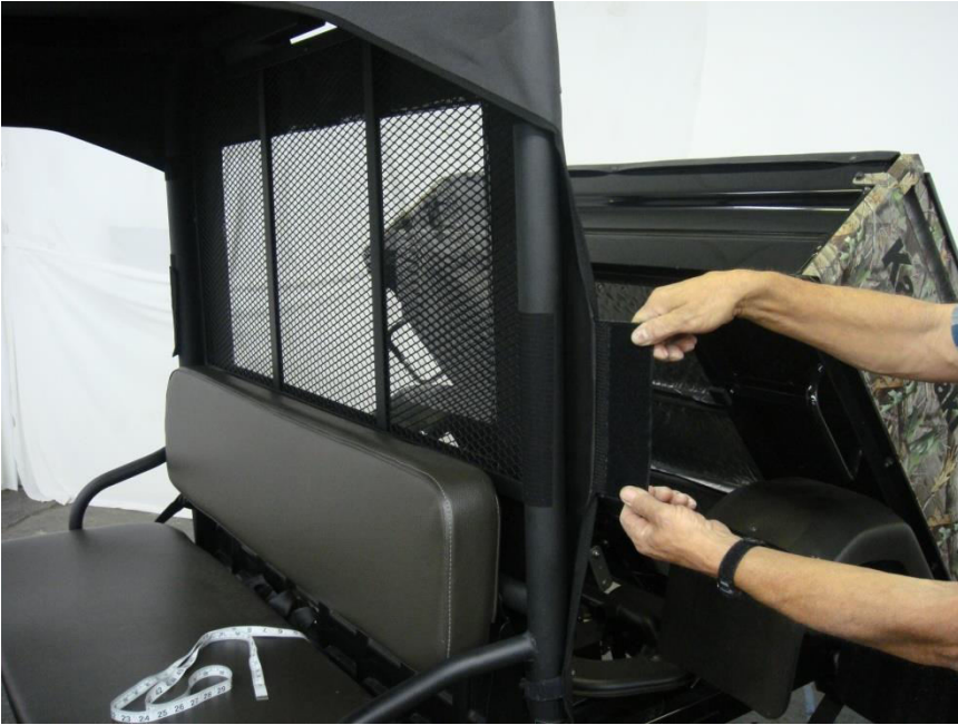
Figure 7.1 – attach Rear Roll Bar Post Velcro tabs – pull upward and outward to tighten back of enclosure

Step 7: Pulling upward & outward on the 8" Rear Roll Bar Post Enclosure Velcro Tabs, attach Rear Roll Bar Post Enclosure tabs to installed 8" Velcro Strips as shown in figure 7.1. Also attach Rear Cab Roll Bar Post enclosure Velcro tabs to installed Velcro strips as shown in figure 7.2. This should straighten out and tighten the back window section of the Enclosure. Repeat both sides.