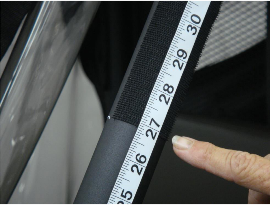
Figure 2.3 - 8" Velcro Strips placed vertically 27" above the front roll bar post bolts