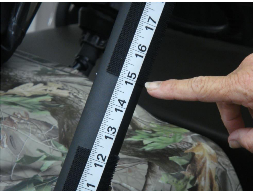
Figure 2.2 - 8" Velcro strips placed vertically 15" above the front roll bar post bolts