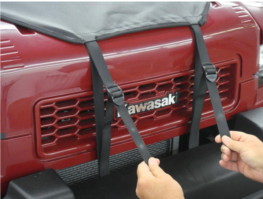
Figure 10.1 – fully tighten hood straps by pulling downward on both straps at the same time until front windshield is tight

Step 10: Tighten Front Hood Straps by pulling downward from the buckle on both strap ends at the same time as shown in figure 10.1. Tighten both straps simultaneously until front windshield is tight