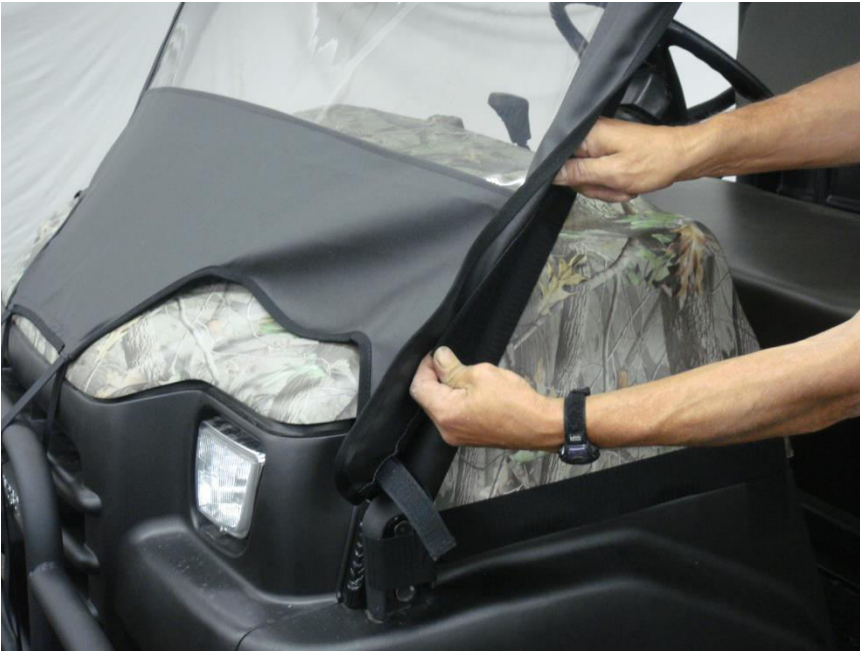
Figure 9.3 - attach lower front Roll Bar Velcro Tab pulling outward and downward toward the front of the vehicle

Step 10: Tighten Front Hood Straps by pulling downward from the buckle on both strap ends at the same time as shown in figure 10.1. Tighten both straps simultaneously until front windshield is tight