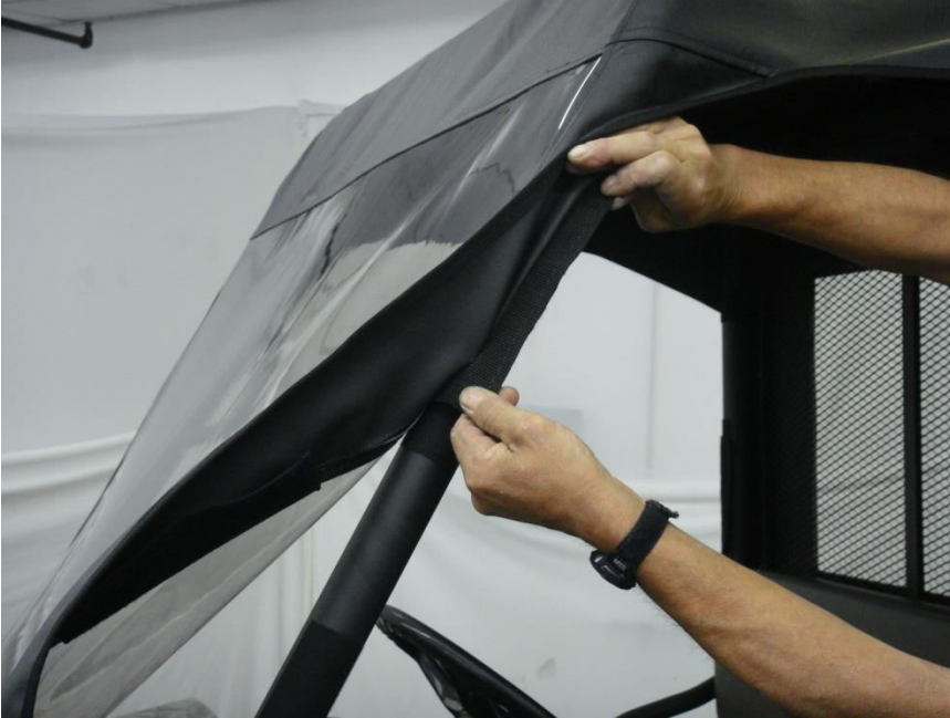
Figure 9.1 – attach top front Roll Bar Velcro Tab pulling outward and downward toward the front of the vehicle

Step 9: Starting with the top Front Roll Bar Post Enclosure tabs pull outward and downward attaching tabs to 8" inch Velcro Strips on the Front Roll Bar as shown in figure 9.1. Repeat this process with the lower Front Roll Bar Enclosure Tabs as shown in figure 9.2 and 9.3 making sure that the Windshield is centered between the Roll Bar posts. Also attach front Roll Bar Bolt section Velcro Tab to the installed Bolt Section Velco strip horizontally around Roll Bar as shown in figure 9.4. Repeat both sides.