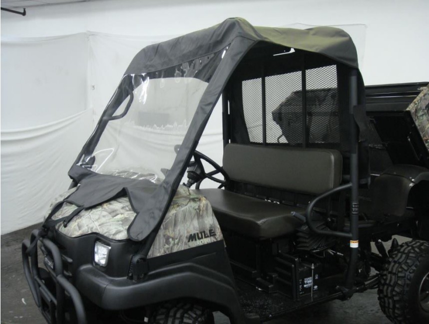
Figure 5.1 - place enclosure on vehicle cab roll bar structure

Step 5: Place the Summer Cab Enclosure on top of the Roll Bar Cab Frame as shown in figure 5.1 and adjust so that enclosure seams are located near the center of the Roll Bars. The vehicle bed will need to be raised for this installation step. Correct orientation is with enclosure hood straps in the front of the vehicle.