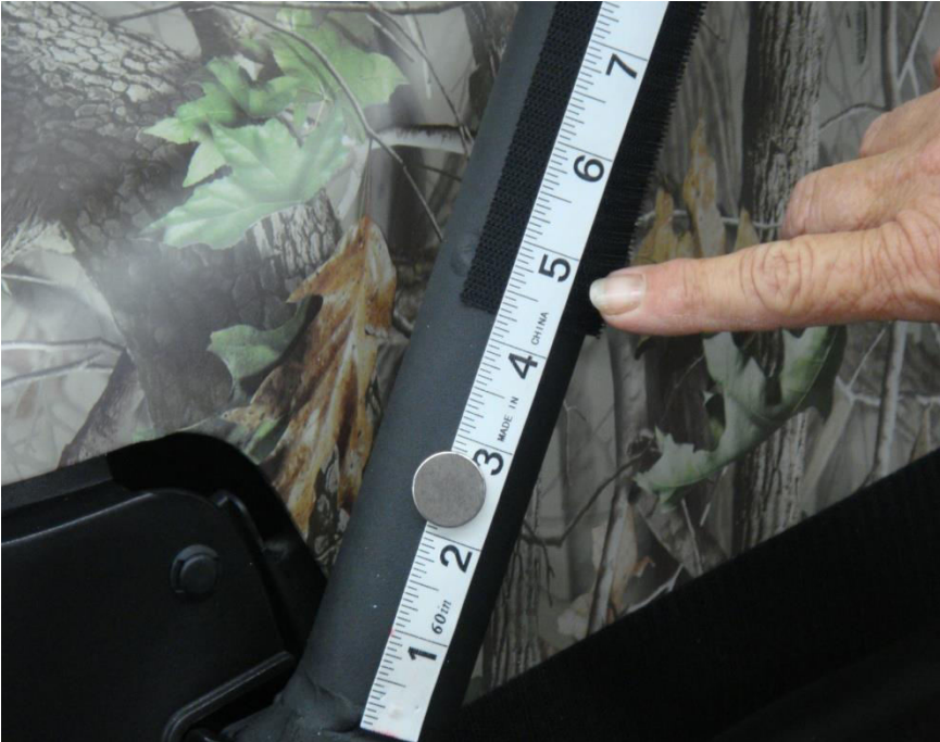
Figure 2.1 - 8" Velcro strips placed vertically 4 ¼" above the front roll bar post bolts

Step 2: Remove the clear plastic backing from the 8" Velcro strips and adhere to the Front Cab Roll Bar Posts at 4 ¼", 15" and 27" above the front roll bar post bolts as shown in figures 2.1, 2.2 and 2.3. Also place 8" Velcro Strips 23" below the top rear cab roll bar cross-member bolted section as shown in figure 2.4. Velcro strips should face away from the center of the cab. Repeat both sides.