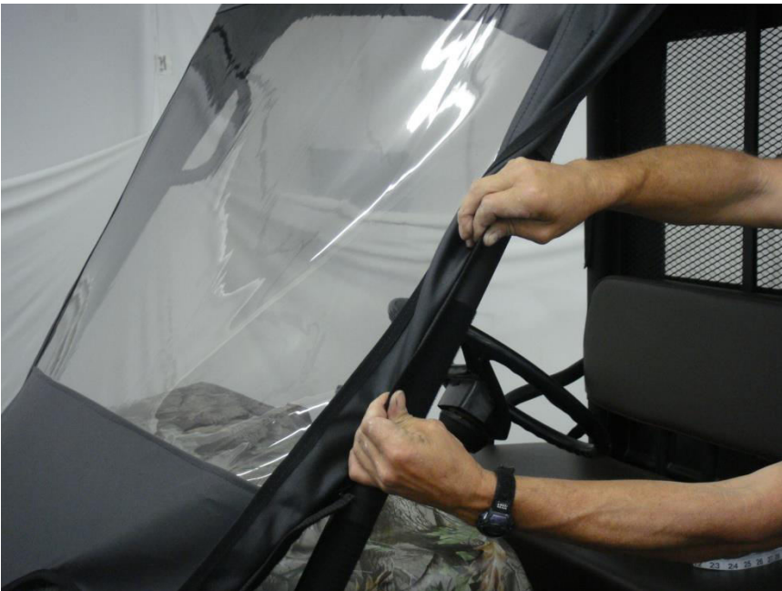
Figure 9.2 - attach middle front Roll Bar Velcro Tab pulling outward and downward toward the front of the vehicle