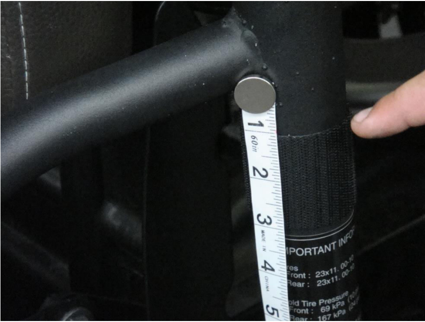
Figure 3.1 - 6" Velcro placed horizontally 1" below the Arm Rest Bar

Step 4: Remove the clear plastic backing from the 49" Velcro strip and adhere to the rear cab guard 9" below the bottom of the rear cab window frame on the upper raised guard rib as shown in figure 4.1. Note you will need to raise the vehicle bed to perform this installation step