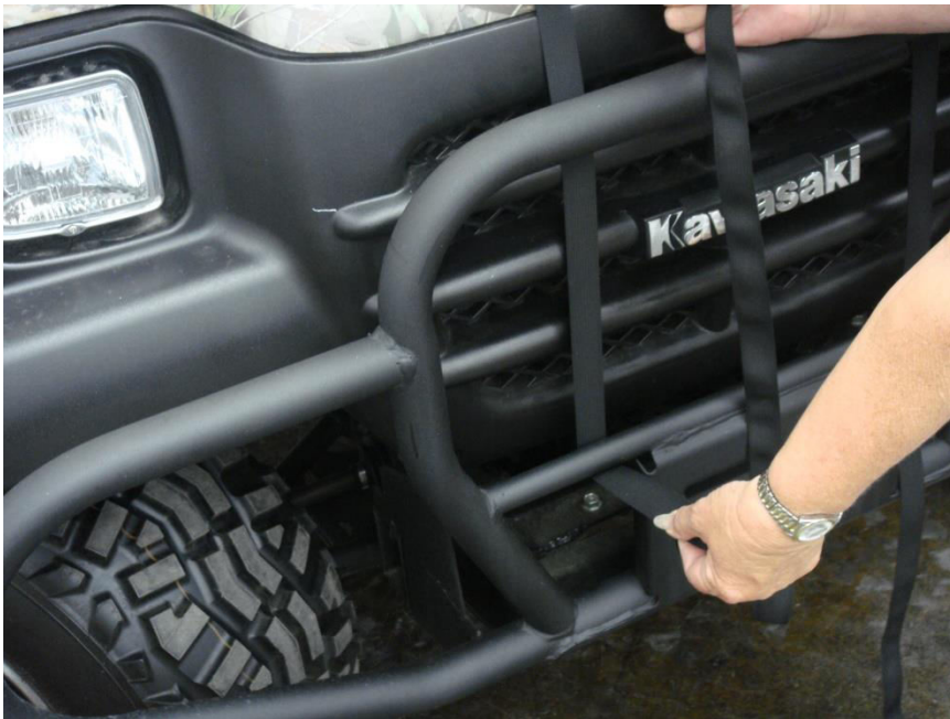
Figure 8.1 - run front hood straps through the center bar of the front bumper

Step 8: Fasten pre-attached Enclosure Front Hood Straps to the center bar of the Vehicle front bumper as shown in figure 8.1. Bringing the end of the straps up to the latch buckle, run the end through the back of the top buckle opening first and then through the front of the lower buckle opening as shown in figure 8.2. DO NOT FULLY TIGHTEN FRONT HOOD STRAPS AT THIS TIME.