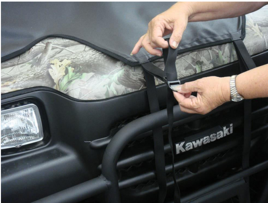
Figure 8.2 - thread front hood straps into buckles