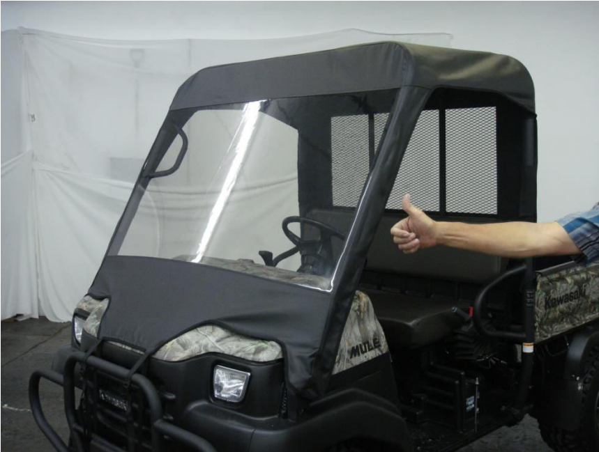
Figure 11.1 - follow steps 7, 9 and 10 to fully tighten cab enclosure

Step 11: Repeat Steps 7, 9 and 10 until the Enclosure fits snugly to the Vehicle Roll Bar structure and front and rear windows are tight as shown in figure 11.1