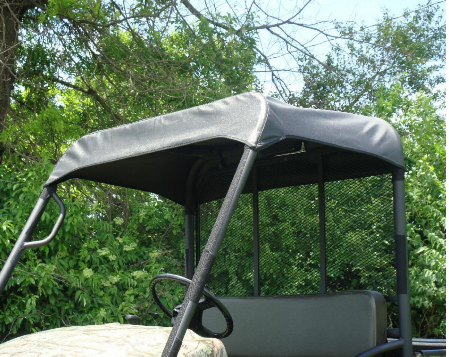
Figure 5.1 - re-tighten each Velcro Tab until the Top Cap is tight on all sides and no major wrinkles are showing.

Step 5: Repeat step 4 pulling downward firmly and re-attaching each of the Velcro Tabs until the Top Cap is tight and there are no wrinkles in the Top Cap Enclosure as shown in figure 5.1