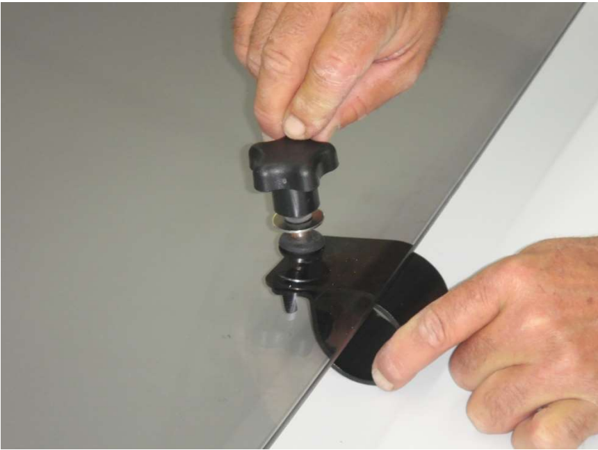
Figure 3.1 - Disassemble the Quick Connect Clamps and reassemble around the roll bar

Step 4: Reposition the Windshield and Clamps slightly so that Windshield Holes and Clamp holes match. Replace the Knobs and Washers as shown in figure 4.1