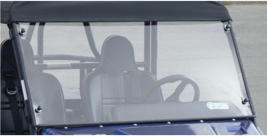
Figure 6.1 - Windshield should be aligned as shown with proper installation

Note: DO NOT CLEAN YOUR LEXAN WINDSHIELD WITH ANYTHING BUT WATER AND A SOFT RAG