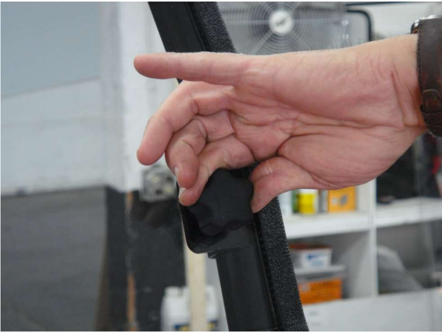
Figure 5.1 - tighten all "Quick Connect" knobs