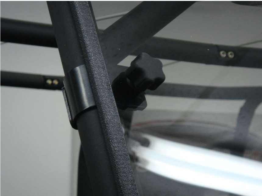
Figure 5.2 - When Knobs are tightened they should hold the flat side of the Clamp flat against the inside of the Windshield

Step 6: Remove protective plastic paper from Windshield