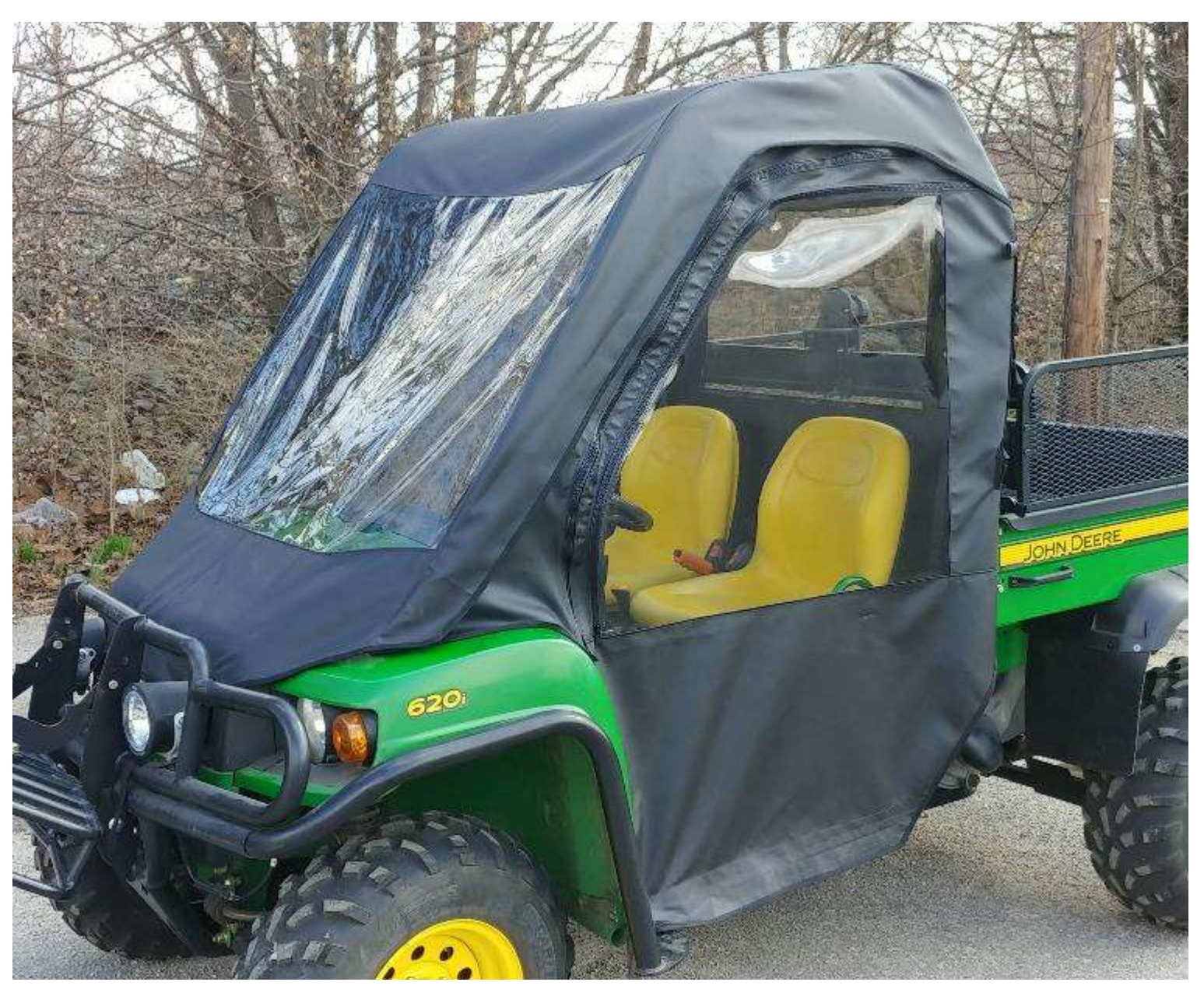
After all parts are installed, wrap the straps on the front end of the machine around the cattle guard. Thread straps through the buckle and pull down tight.