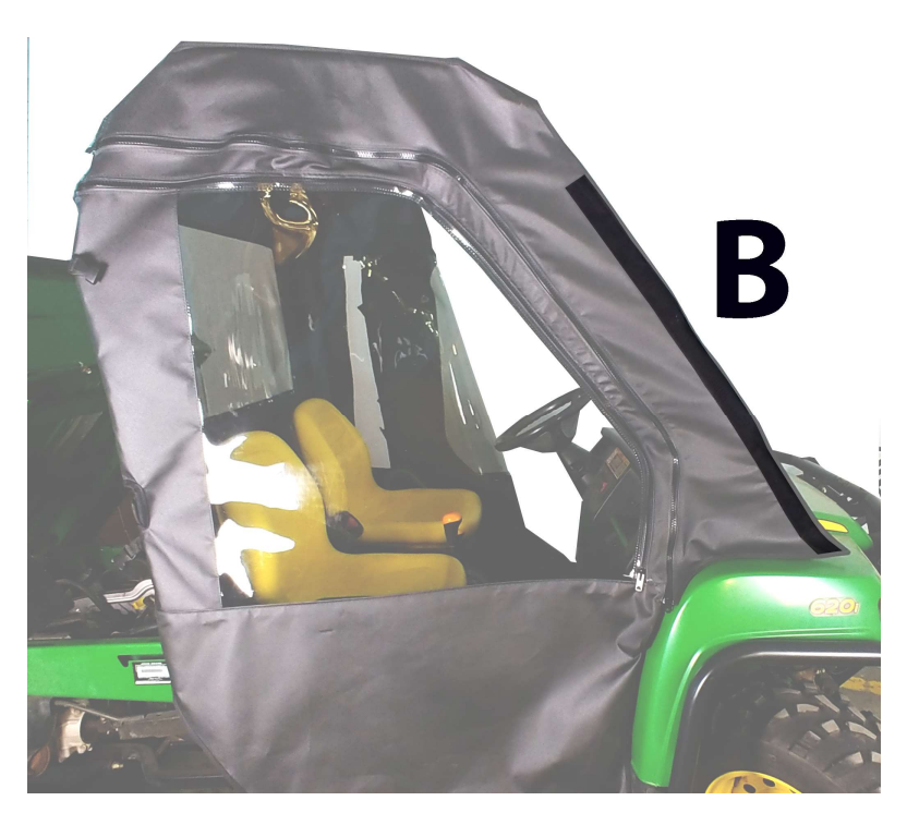
Figure 2: Corresponding tabs are sewn on to the inside of the windshield top.