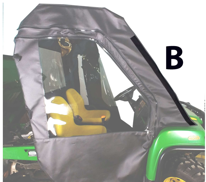
Figure 2: Corresponding tabs are sewn on to the inside of the windshield top.