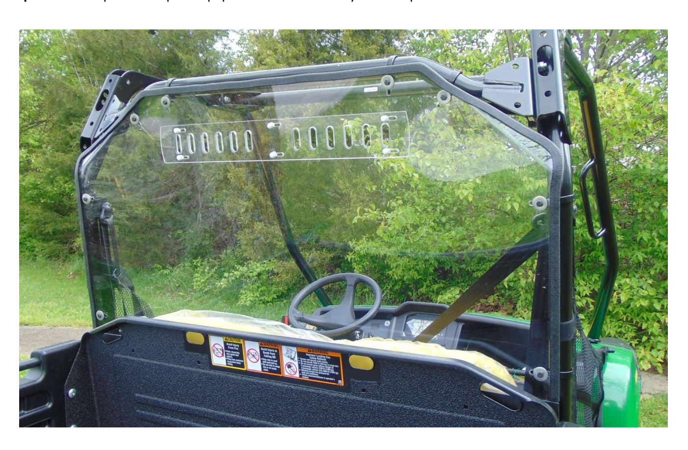
Step 8: Remove protective plastic paper from each side of your back panel.

Step 7: After all bolts have been installed and the back panel is centered and in proper alignment, tighten the nuts on each clamp.