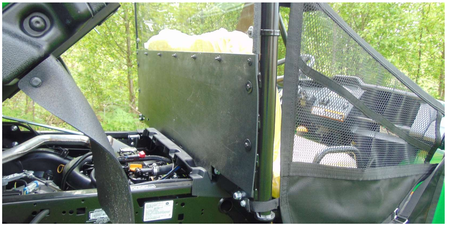
Step 5: Additional bolt holes have been drilled on the bottom of the lower section. The back panel should align with holes in the vehicles frame. When aligned, insert a hex head bolt with flat washer thru the bolt-hole openings in the back panel and thru the holes in the plates. Insert a nut on each bolt and tighten.

Step 7: After all bolts have been installed and the back panel is centered and in proper alignment, tighten the nuts on each clamp.