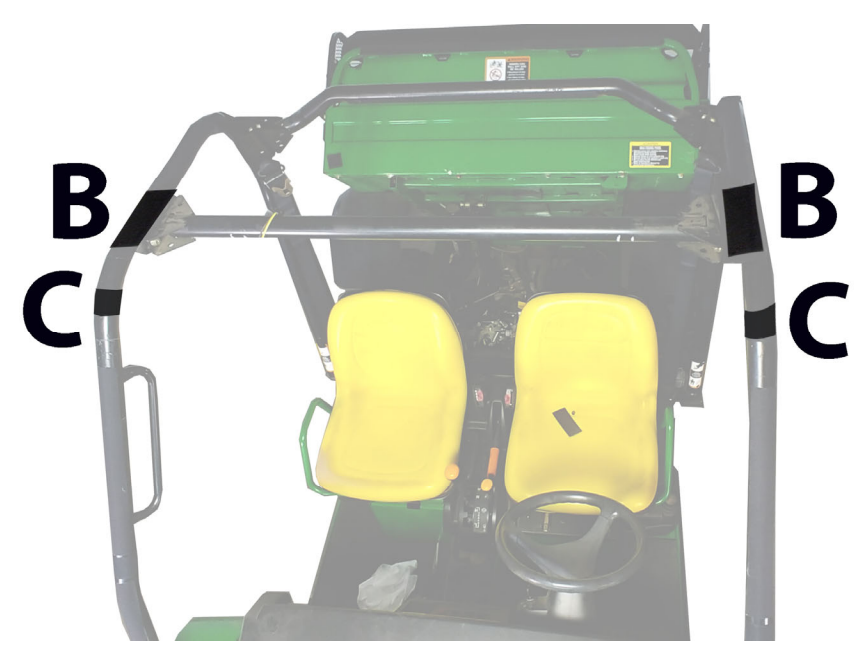
Figure 2: Shows placement of Velcro strips B and C.