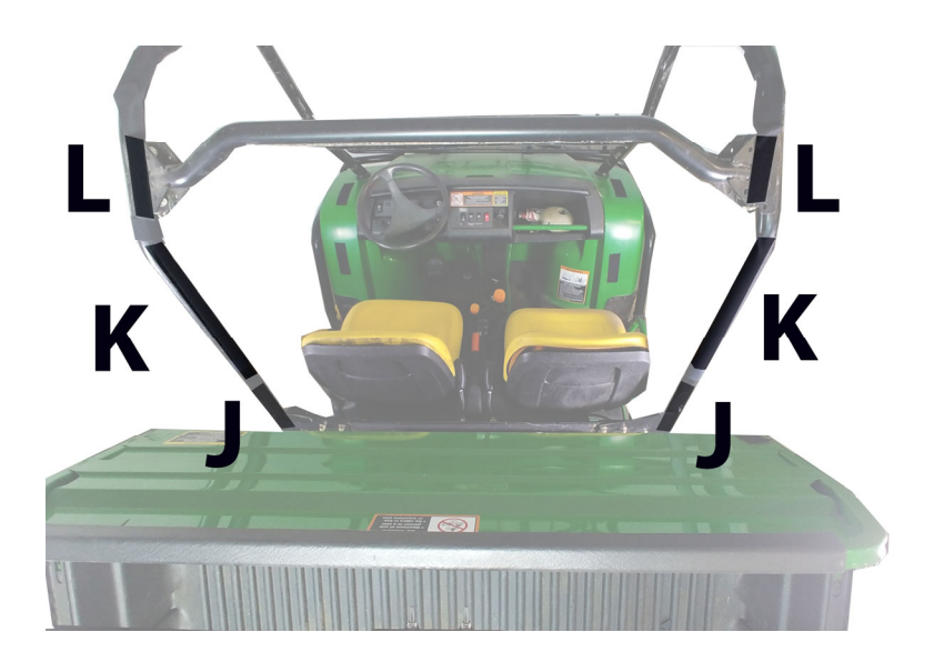
Figure 6: Shows position of Velcro strips J, K and L.