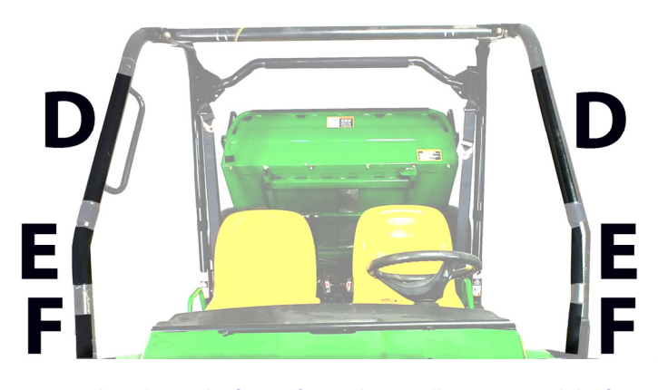
Figure 3: The tabs on the front of your doors will wrap around the front of the roll bar and attach to the Velcro strip.