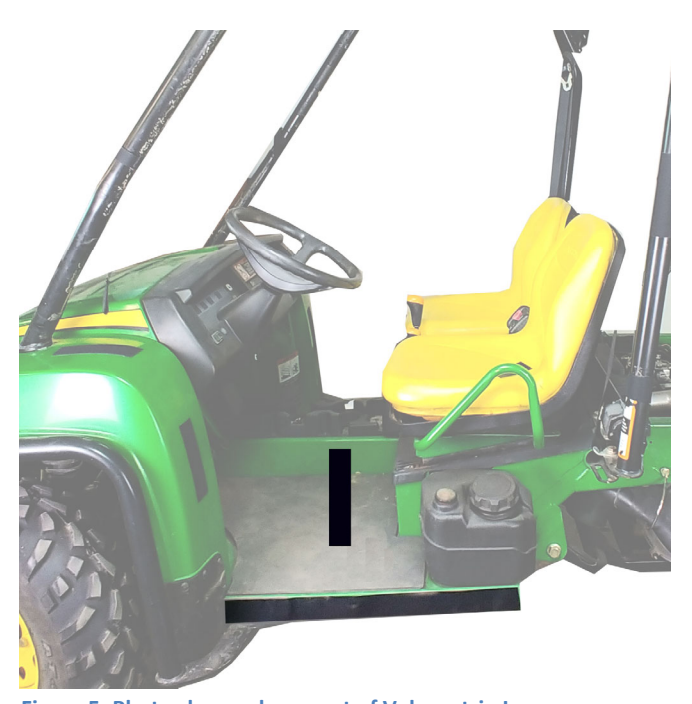
Figure 5: Photo shows placement of Velcro strip I.