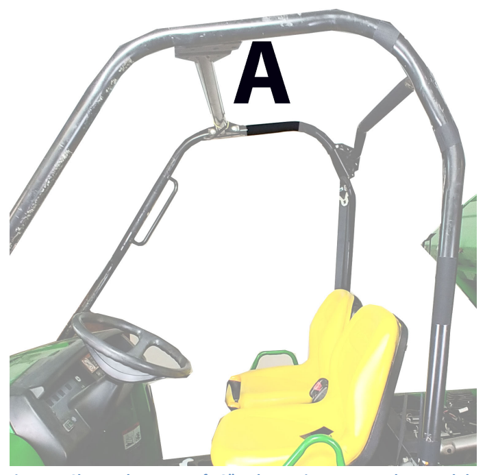
Figure 1: Shows placement of 12" Velcro strip A. Wrap tab around the top of the roll bar.