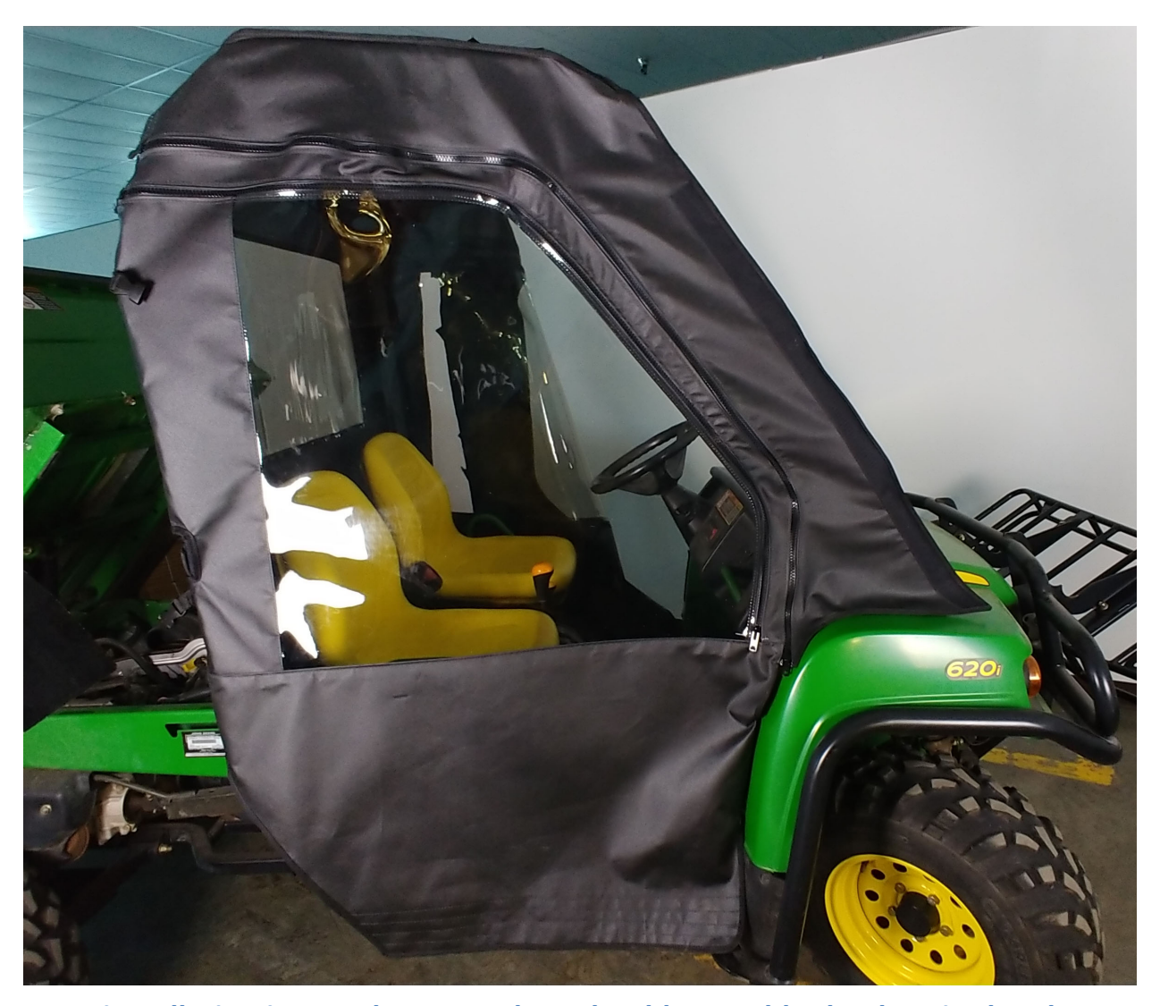
Once installation is complete your door should resemble the door in the photo.