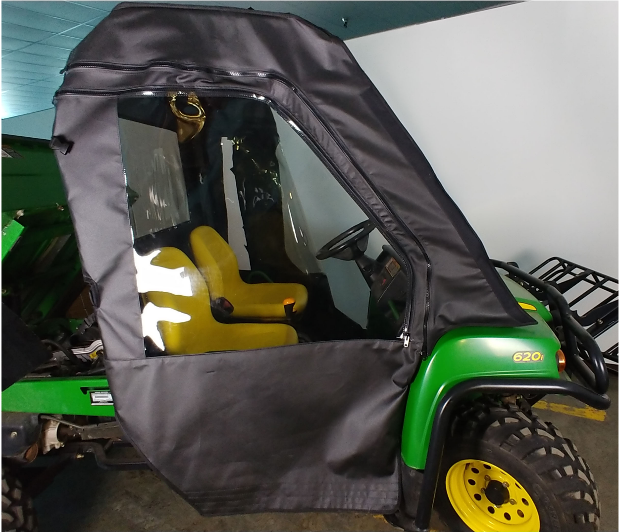
Once installation is complete your door should resemble the door in the photo.