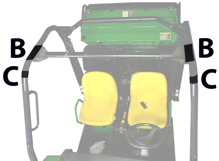
Figure 2: Shows placement of Velcro strips B and C.