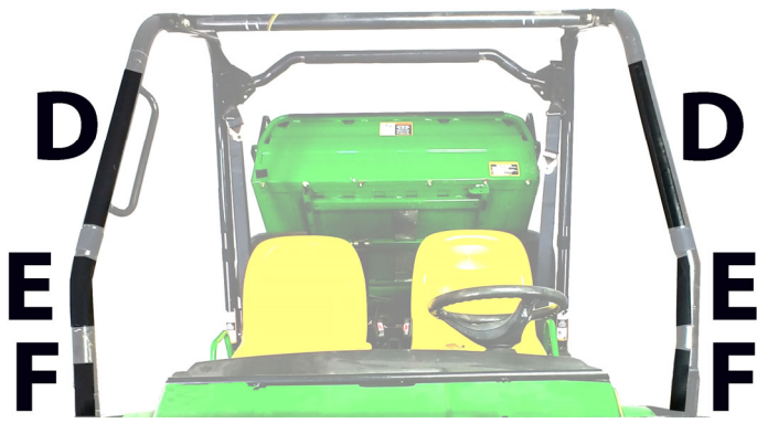
Figure 3: The tabs on the front of your doors will wrap around the front of the roll bar and attach to the Velcro strip.