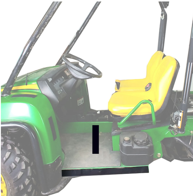
Figure 5: Photo shows placement of Velcro strip I.