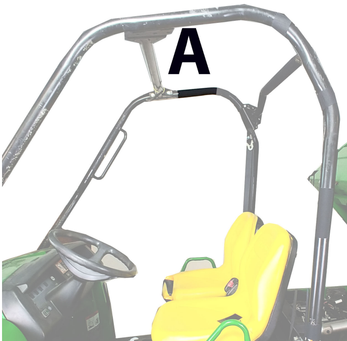
Figure 1: Shows placement of 12" Velcro strip A. Wrap tab around the top of the roll bar.