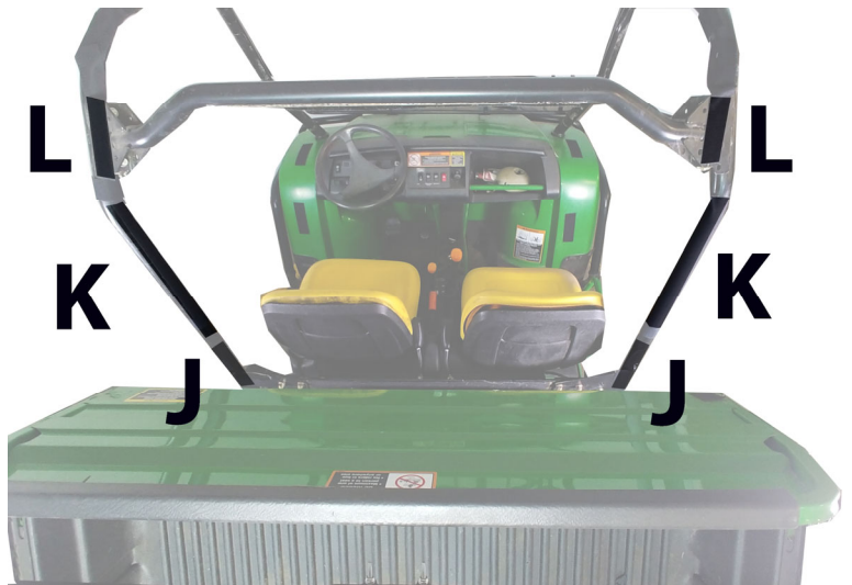
Figure 6: Shows position of Velcro strips J, K and L.