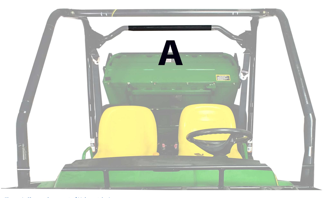
Figure 1: Shows placement of Velcro strip A.