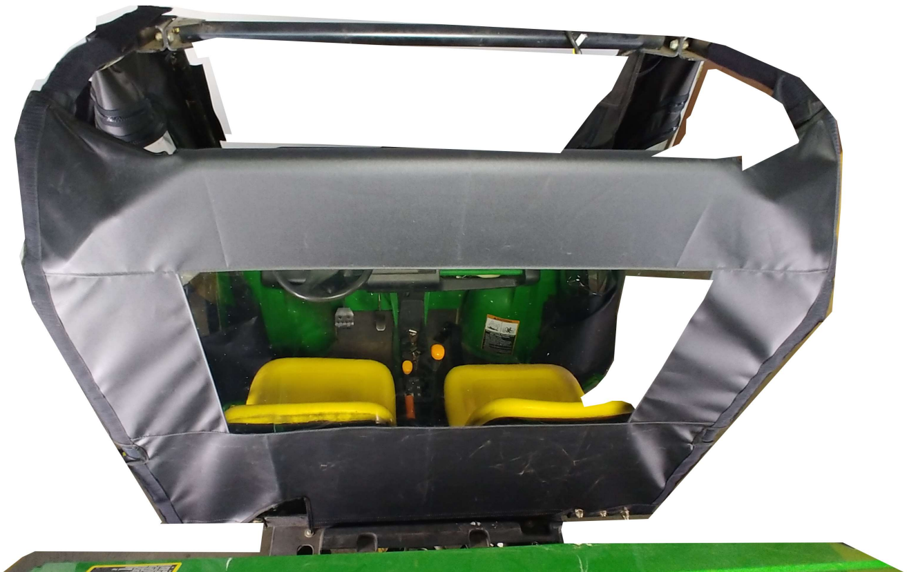
Picture is an example of how you back panel should fit.