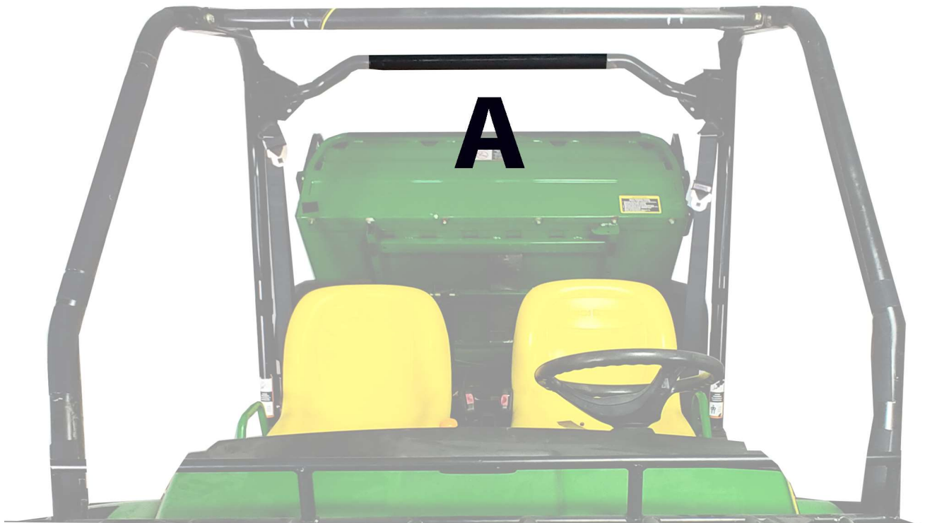
Figure 1: Shows placement of Velcro strip A.