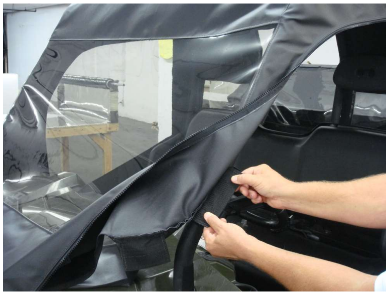
Tighten hood straps by pulling downward from the buckle on both strap ends at the same time as shown below.