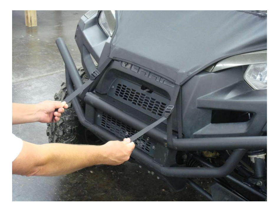
Step 4 : Repeat any steps necessary to achieve a snug fit on the cab frame.

Tighten front hood straps by pulling downward from the buckle on both strap ends at the same time as shown below. DO NOT FULLY TIGHTEN UNTIL THE TENSION STRAP ON THE BACK OF THE WINDSHIELD/TOP IS IN PLACE.