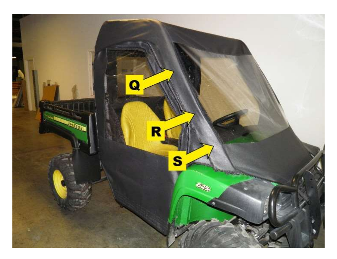
Step 3: After all adhesive hook strips are attached, begin attaching the enclosure to the cab frame. As you attach the hook and loop, square each panel to the frame. PLEASE NOTE, FOR MAXIMUM ADHESION, ALLOW THE ADHESIVE HOOK TO ADHERE TO THE FRAME FOR 24 HOURS BEFORE PULLING AGAINST THE HOOK WITH THE LOOP STRIPS.

Step 4 : With the windshield/top on the cab frame, attach the front straps as shown below.