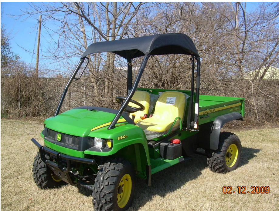
Figure 6.1 - re-tighten each Velcro Tab until the Top Cap is tight on all sides and no major wrinkles are showing.

Step 6: Repeat step 4 pulling downward firmly and re-attaching each of the Velcro Tabs until the Top Cap is tight and there are no wrinkles in the Top Cap Enclosure as shown in figure 5.1