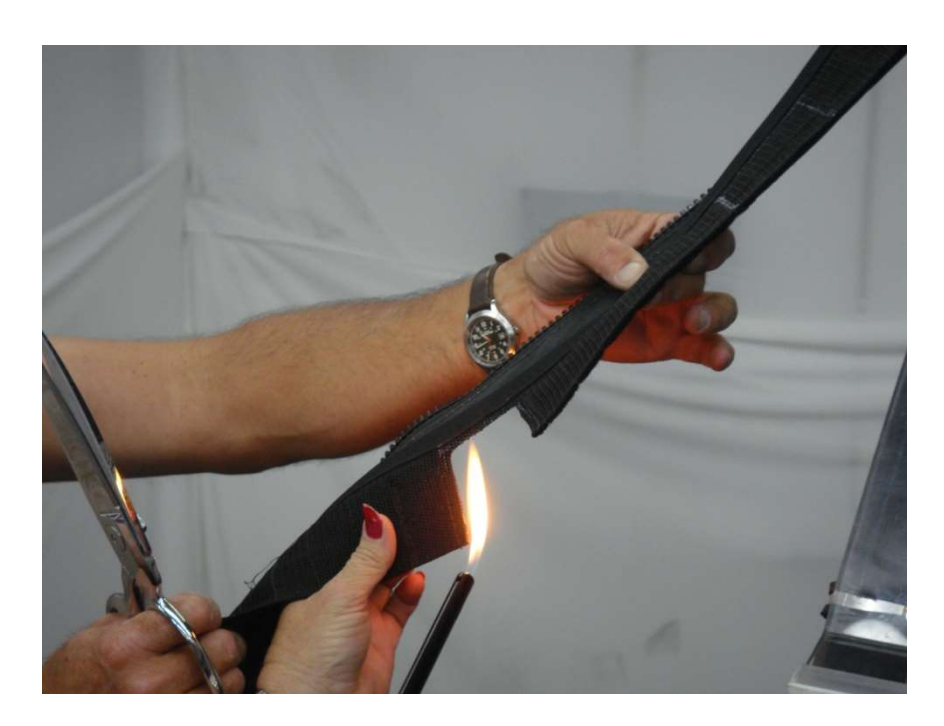
Seal Frayed Tab thread at the cut area using a lighter