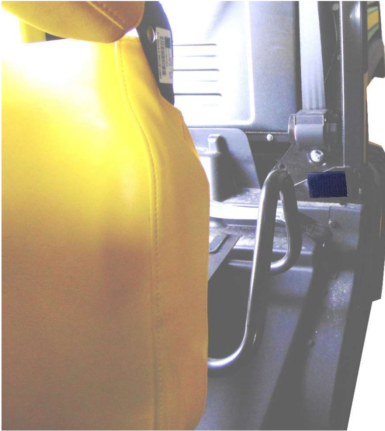
Figure 5: Shows placement of 3" Velcro strip F. Raise seat all the way up and place strip under the seat belt roll.