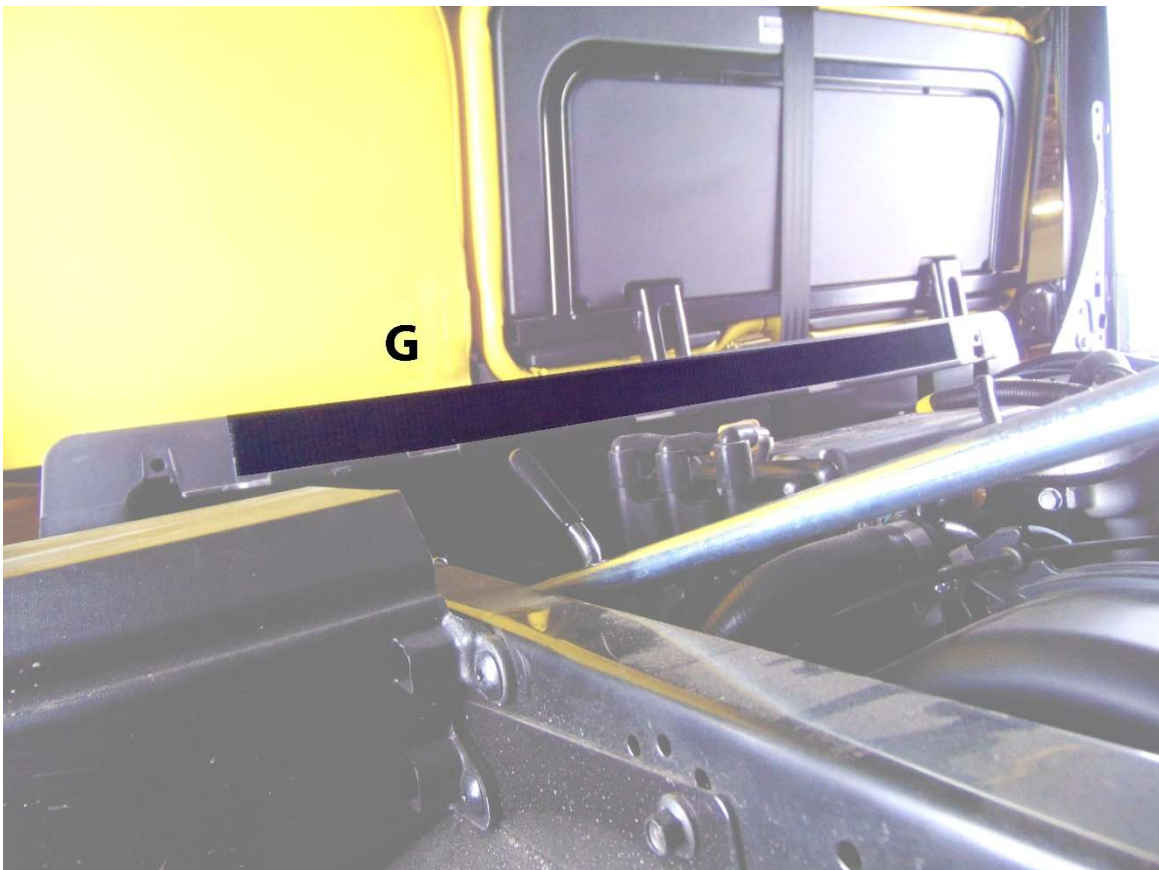
Figure 6: Shows placement of 34" Velcro strip G. Raise bed, attach to the flat bracket behind the seat.