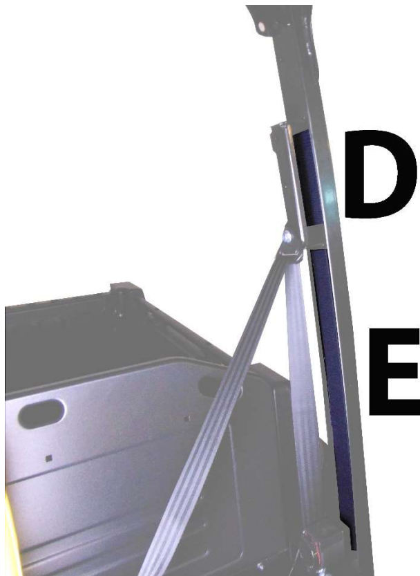
Figure 4: Shows placement of 7" Velcro strip D and 22" Velcro strip E.