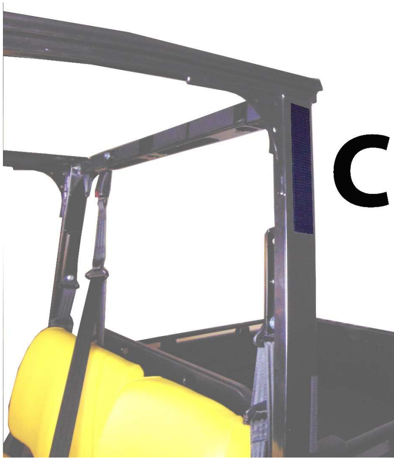
Figure 3: Shows placement of 10" Velcro strip C.