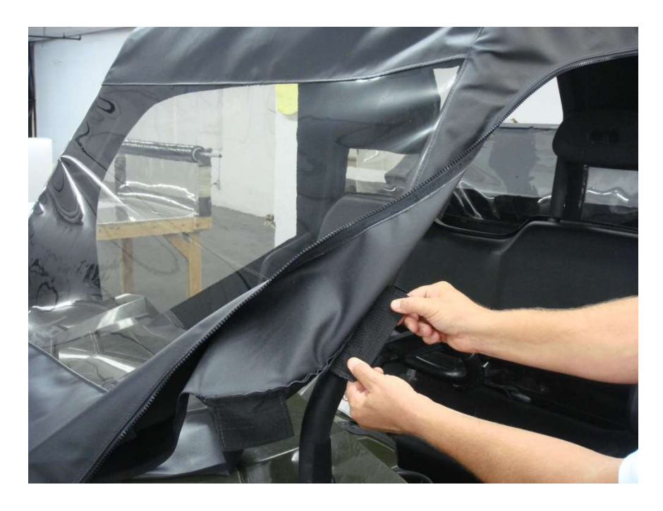
Step 6: Tighten hood straps by pulling downward from the buckle on both strap ends at the same time as shown below.