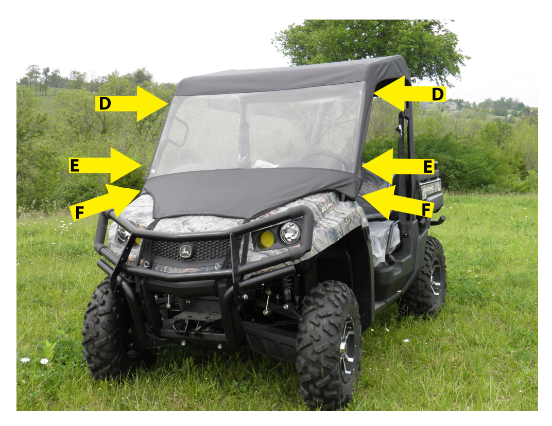
Step 3: After all adhesive hook strips are attached, begin attaching the enclosure to the cab frame. As you attach the hook and loop, square the enclosure to the frame. PLEASE NOTE, FOR MAXIMUM ADHESION, ALLOW THE ADHESIVE HOOK TO ADHERE TO THE FRAME FOR 24 HOURS BEFORE PULLING AGAINST THE HOOK WITH THE LOOP STRIPS.

Step 4: Fasten the front hood straps to the vehicle front bumper as shown below. Bringing the end of the straps up to the latch buckle, run the end through the back of the top buckle opening first and then through the front of the lower buckle opening as shown below. DO NOT FULLY TIGHTEN FRONT HOOD STRAPS AT THIS TIME.