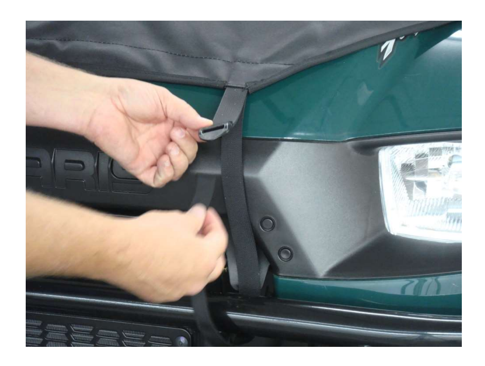
Step 5: Before tightening the hood straps, make sure the windshield is square and pulled tight from side to side. Grasp the 8" webbing/loop tabs on either side of the windshield and reposition to center and tighten the windshield as shown below.