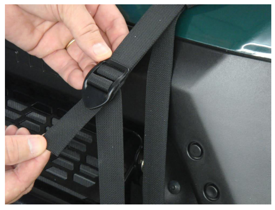
Step 5: Before tightening the hood straps, make sure the windshield is square and pulled tight from side to side. Grasp the 8" webbing/loop tabs on either side of the windshield and reposition to center and tighten the windshield as shown below.