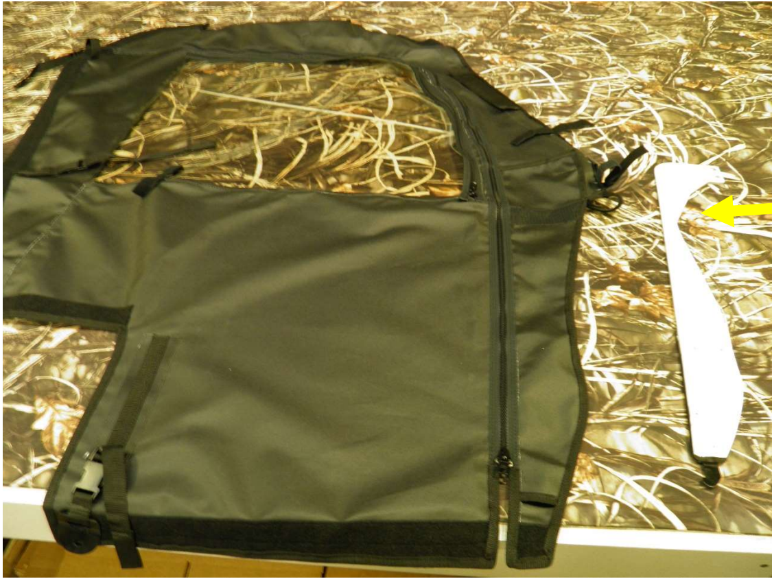
Polycarbonate door insert with metal brace