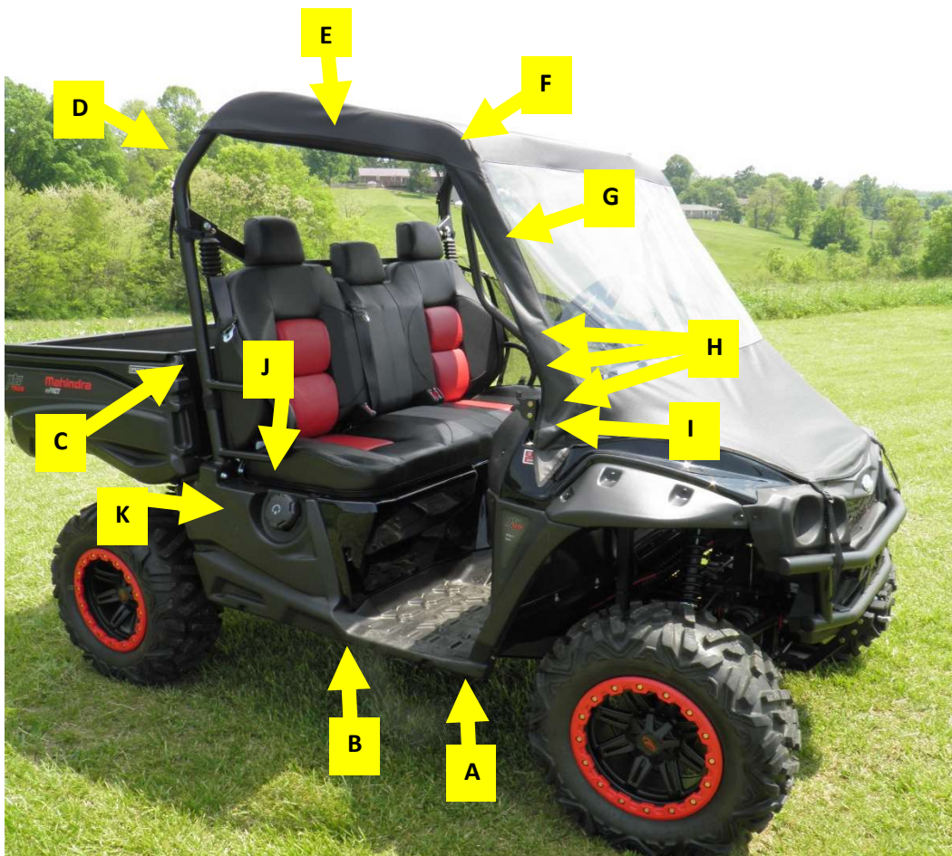
PASSENGER DOOR VIEW