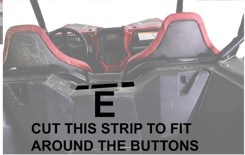
CUT THIS STRIP TO FIT AROUND THE BUTTONS