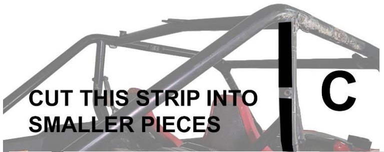
CUT THIS STRIP INTO SMALLER PIECES