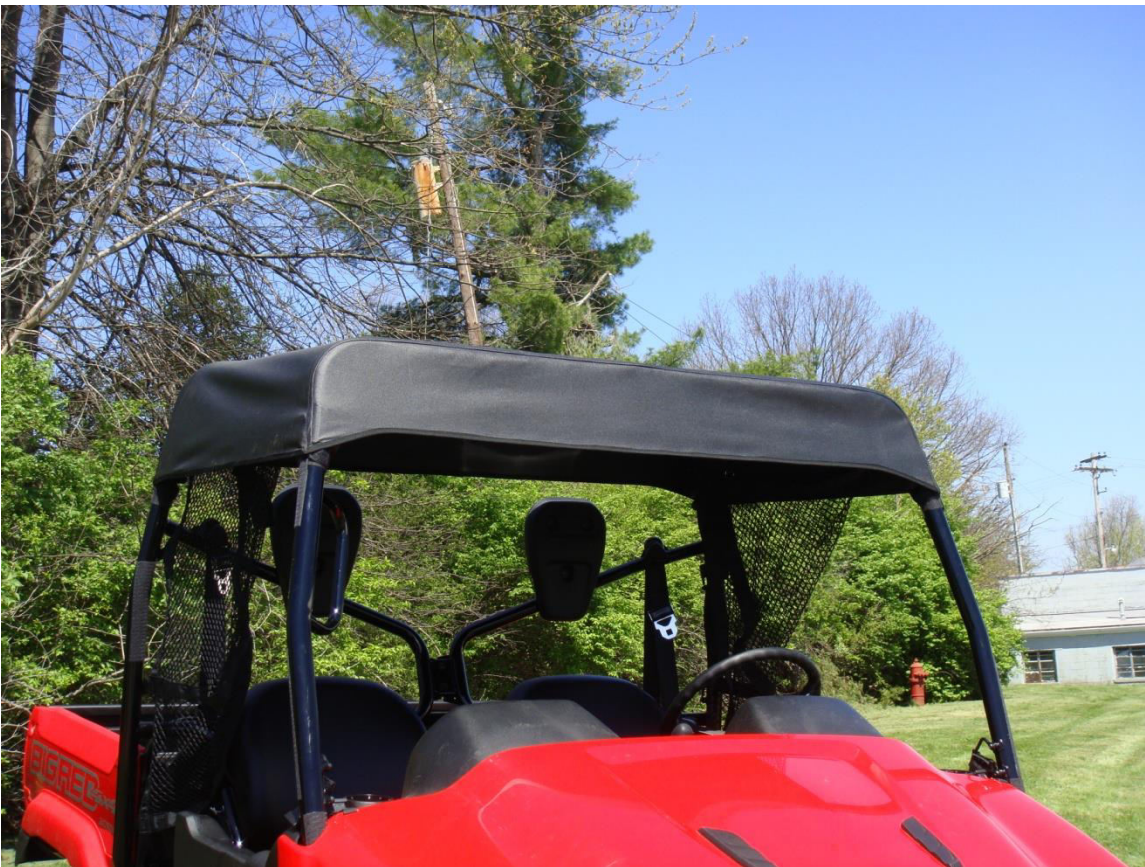
Figure 5.1 - re-tighten each Velcro Tab until the Top Cap is tight on all sides and no major wrinkles are showing.

Step 5: Repeat step 4 pulling downward firmly and re-attaching each of the Velcro Tabs until the Top Cap is tight and there are no wrinkles in the Top Cap Enclosure as shown in figure 5.1