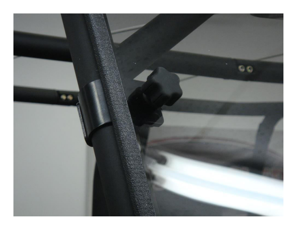
Figure 5.2 - When Knobs are tightened they should hold the flat side of the Clamp flat against the inside of the Windshield