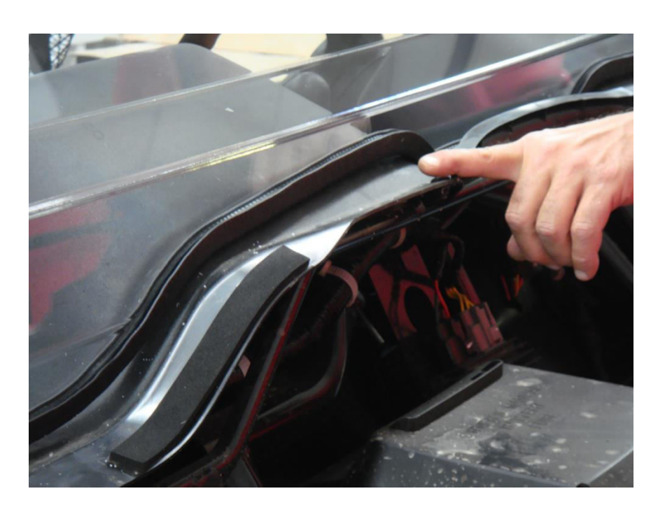
Figure 2.2 - place windshield so that the bottom contour rests on the top of the vehicle cowl