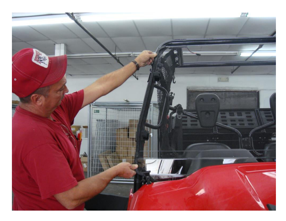
Figure 2.1 - Center Windshield between roll bar so that edges are in the center of the front Roll Bar posts