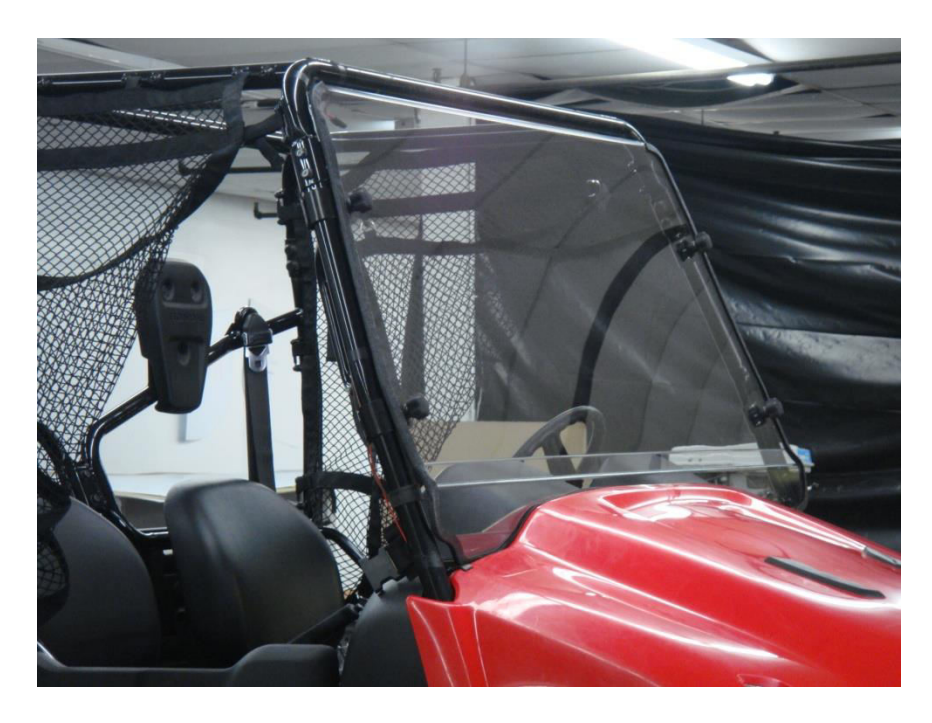
Figure 6.1 - Windshield should be aligned as shown with proper installation

Note: DO NOT CLEAN YOUR LEXAN WINDSHIELD WITH ANYTHING BUT WATER AND A SOFT RAG. PLEASE REVIEW THE ATTACHED CARE INSTUCTIONS.