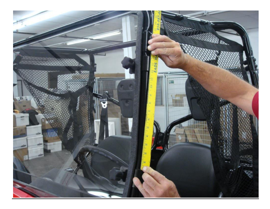
Figure 3.4 - Lower clamp should placed approx 14" below the top clamp

Step 4: Reposition the Windshield and Clamps slightly so that Windshield Holes and Clamp holes match. Replace the Knobs and Washers as shown in figure 4.1