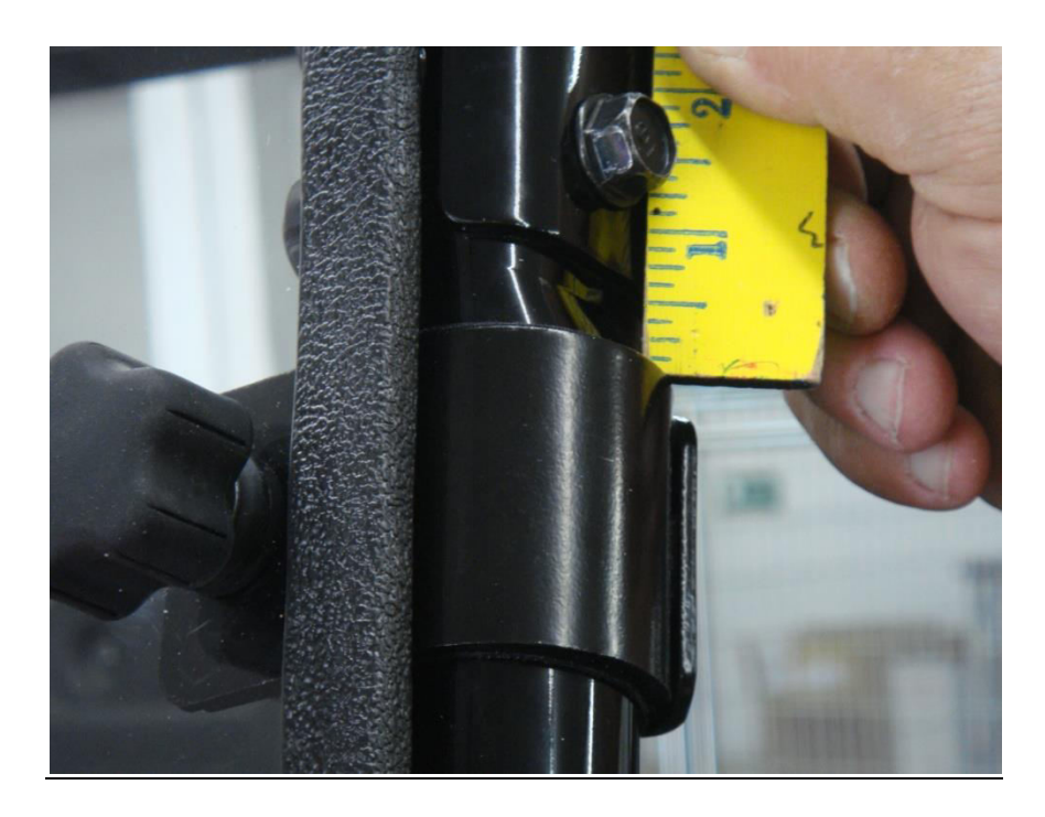
Figure 3.3 - Top clamp should be placed approx 5/8" below the front roll bar upright bolted section