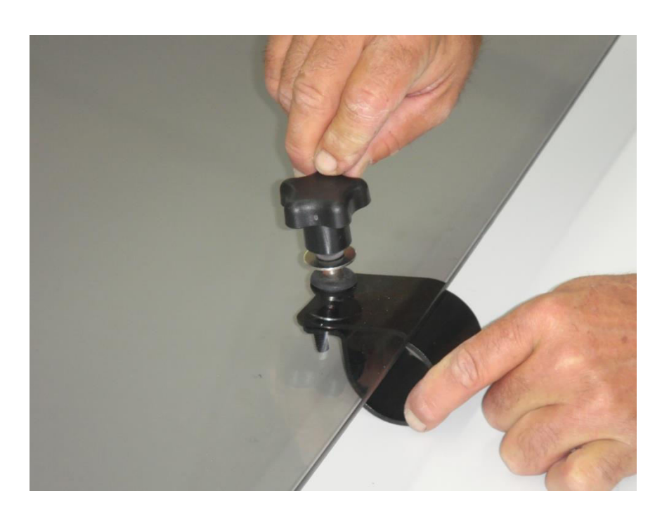
Figure 3.1 - Disassemble the Quick Connect Clamp and reassemble around the roll bar

Step 3: Noting the Windshield hole locations that need to match to the Quick Connect Clamp locations let your assistant hold the windshield outward slightly away from the front Roll bar uprights. Remove the clam knobs and washers and disassemble the Quick Connect Clamps and place the clamps around the roll bar uprights in the appropriate locations as shown in figures 3.3 and 3.4 to match Windshield mounting hole locations. Once the Clamp locations have been determined mark locations with a pencil and wrap the 5" sticky Velcro horizontally around the roll bar and attach the 5" piece of loop around it as shown in figures 3.1 and 3.2. Note: the Velcro will hold the clamps in place on roll bars.