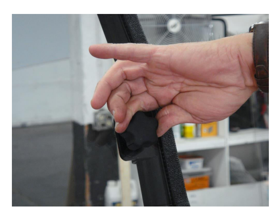
Figure 5.1 - tighten all "Quick Connect" knobs