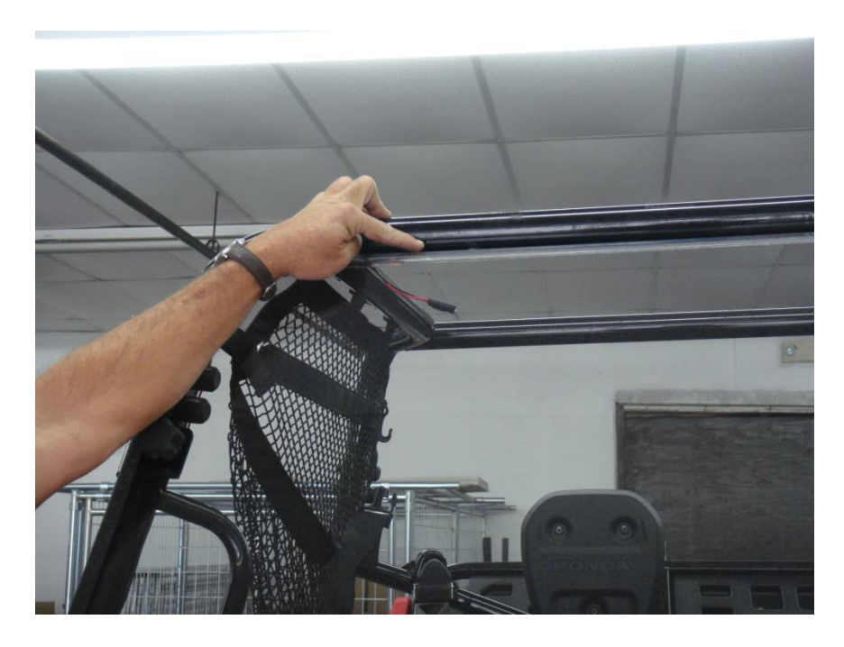
Figure 2.3 - place windshield so that the top polycarbonate tab is approx 1/2" below the Top Roll Bar Cross-member

Step 3: Noting the Windshield hole locations that need to match to the Quick Connect Clamp locations let your assistant hold the windshield outward slightly away from the front Roll bar uprights. Remove the clam knobs and washers and disassemble the Quick Connect Clamps and place the clamps around the roll bar uprights in the appropriate locations as shown in figures 3.3 and 3.4 to match Windshield mounting hole locations. Once the Clamp locations have been determined mark locations with a pencil and wrap the 5" sticky Velcro horizontally around the roll bar and attach the 5" piece of loop around it as shown in figures 3.1 and 3.2. Note: the Velcro will hold the clamps in place on roll bars.