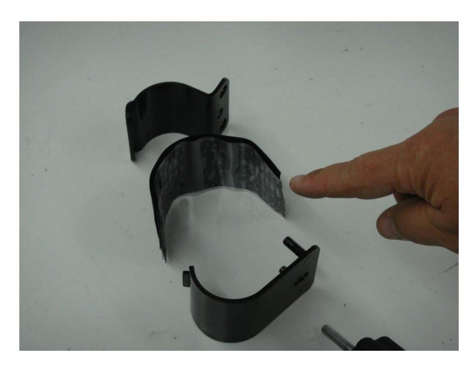
Figure 3.2 - attach sticky Velcro horizontally around the roll bar underneath each clamp bracket before attaching clamps