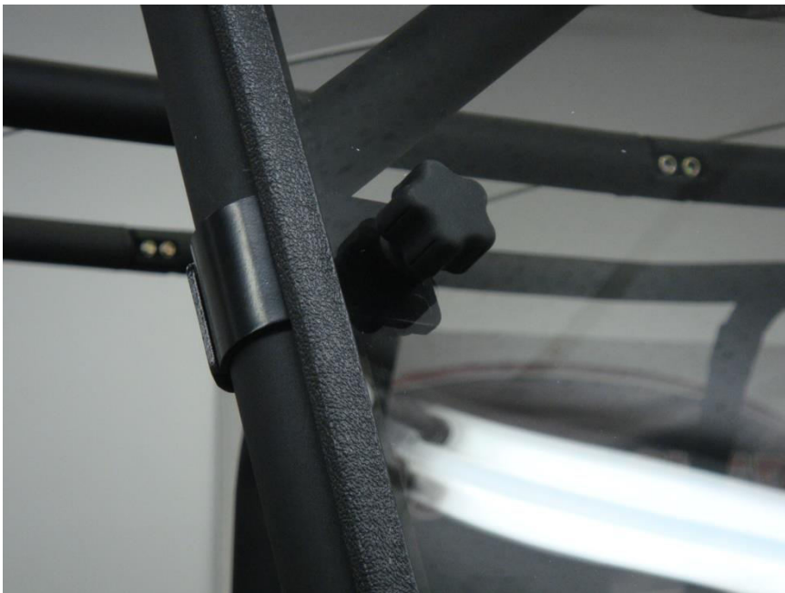
Figure 5.2 - When Knobs are tightened they should hold the flat side of the Clamp flat against the inside of the Windshield