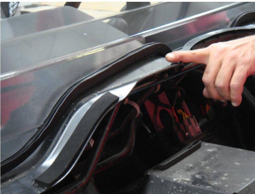
Figure 2.2 - place windshield so that the bottom contour rests on the top of the vehicle cowl