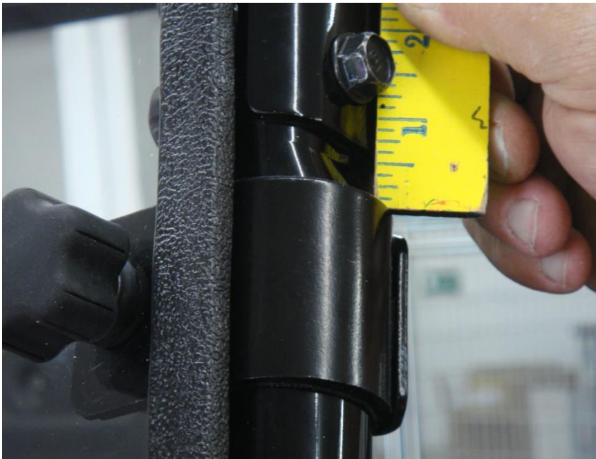
Figure 3.3 - Top clamp should be placed approx 5/8" below the front roll bar upright bolted section