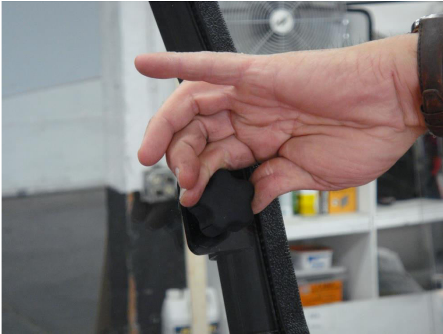
Figure 5.1 - tighten all "Quick Connect" knobs

Step 5: Ensure that you have proper windshield alignment as indicated in step #2 and tighten all Knobs as shown in figure 5.1 and 5.2