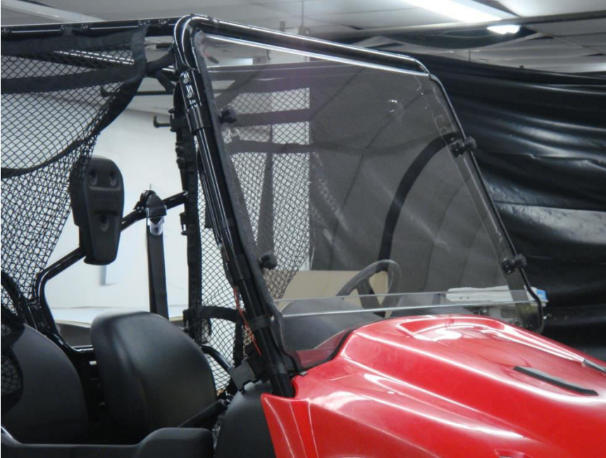
Figure 6.1 - Windshield should be aligned as shown with proper installation

Note: DO NOT CLEAN YOUR LEXAN WINDSHIELD WITH ANYTHING BUT WATER AND A SOFT RAG. PLEASE REVIEW THE ATTACHED CARE INSTRUCTIONS.