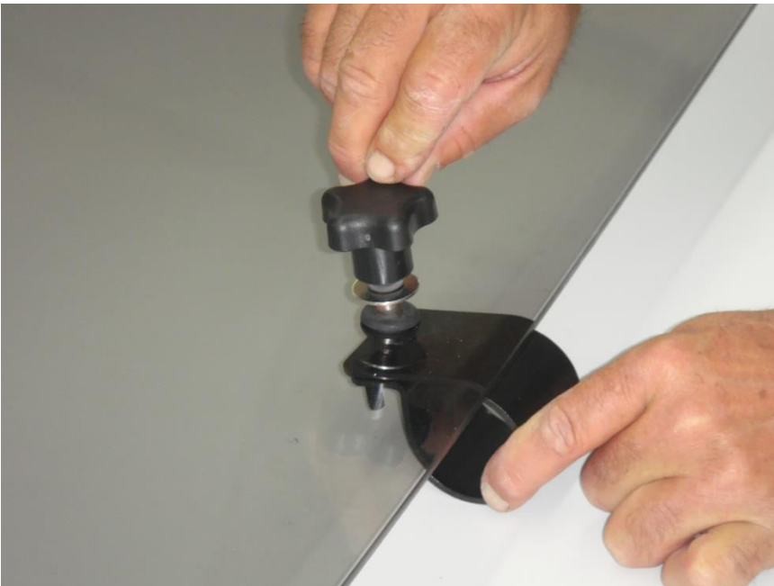
Figure 3.1 - Disassemble the Quick Connect Clamp and reassemble around the roll bar

Step 3: Noting the Windshield hole locations that need to match to the Quick Connect Clamp locations let your assistant hold the windshield outward slightly away from the front Roll bar uprights. Remove the clam knobs and washers and disassemble the Quick Connect Clamps and place the clamps around the roll bar uprights in the appropriate locations as shown in figures 3.3 and 3.4 to match Windshield mounting hole locations. Once the Clamp locations have been determined mark locations with a pencil and wrap the 5" sticky Velcro horizontally around the roll bar and attach the 5" piece of loop around it as shown in figures 3.1 and 3.2. Note: the Velcro will hold the clamps in place on roll bars.