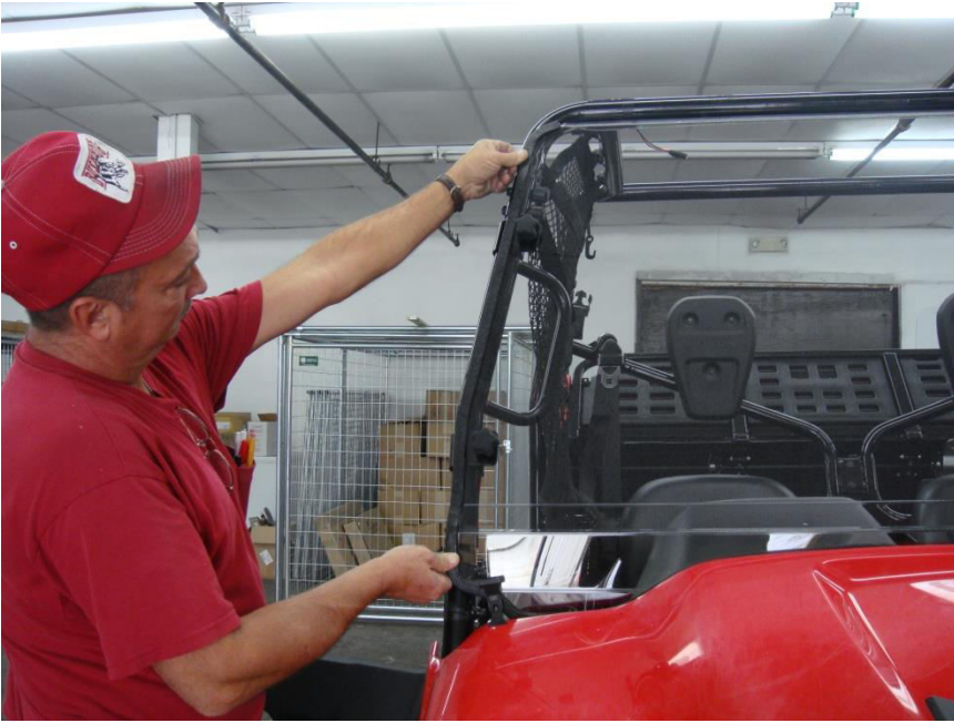
Figure 2.1 - Center Windshield between roll bar so that edges are in the center of the front Roll Bar posts