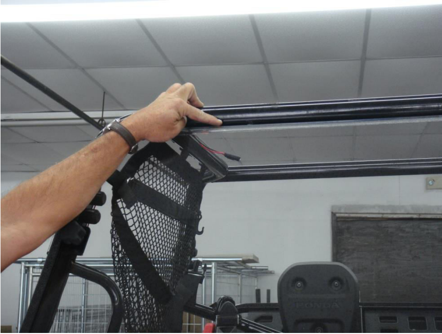
Figure 2.3 - place windshield so that the top polycarbonate tab is approx ¼" below the Top Roll Bar Cross-member

Step 3: Noting the Windshield hole locations that need to match to the Quick Connect Clamp locations let your assistant hold the windshield outward slightly away from the front Roll bar uprights. Remove the clam knobs and washers and disassemble the Quick Connect Clamps and place the clamps around the roll bar uprights in the appropriate locations as shown in figures 3.3 and 3.4 to match Windshield mounting hole locations. Once the Clamp locations have been determined mark locations with a pencil and wrap the 5" sticky Velcro horizontally around the roll bar and attach the 5" piece of loop around it as shown in figures 3.1 and 3.2. Note: the Velcro will hold the clamps in place on roll bars.