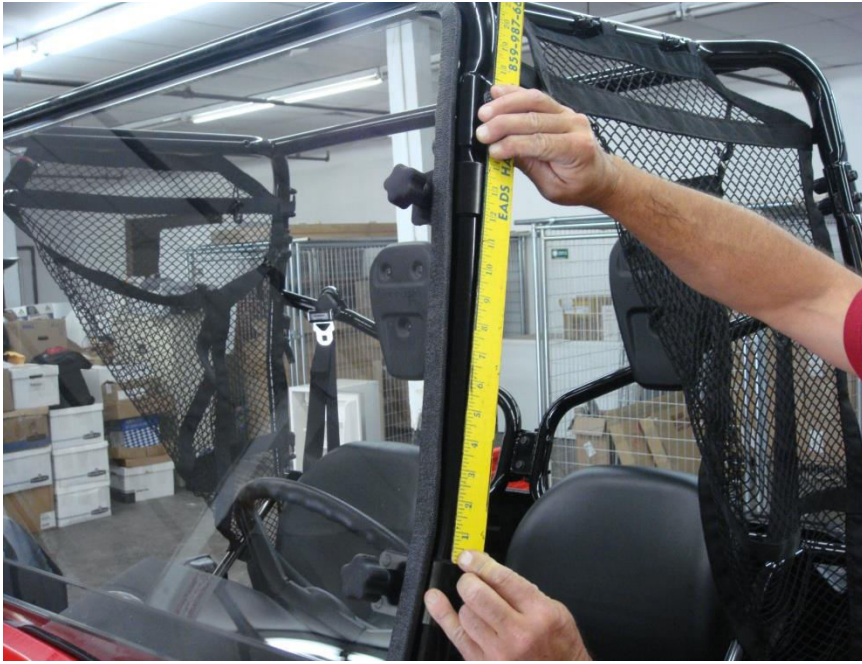
Figure 3.4 - Lower clamp should be placed approx 14" below the top clamp

Step 4: Reposition the Windshield and Clamps slightly so that Windshield Holes and Clamp holes match. Replace the Knobs and Washers as shown in figure 4.1