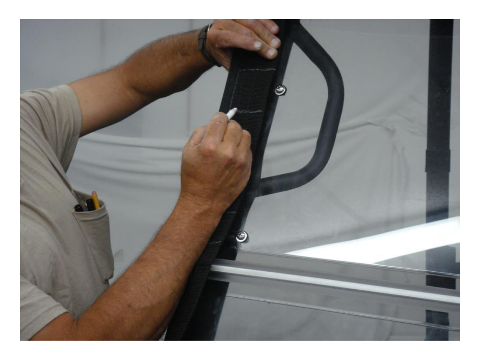
Figure 7.2 - Mark the Windshield Velcro Tabs for hard windshield Clamp locations