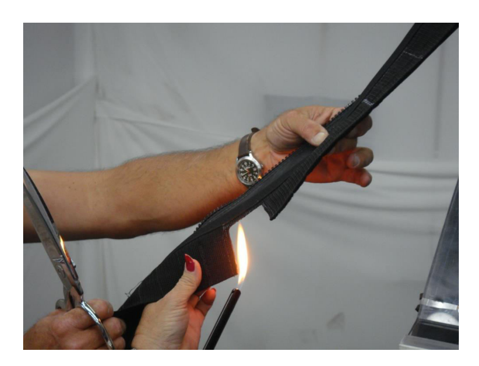
Figure 7.4 – Carefully burn the frayed thread around the cut area with a lighter.