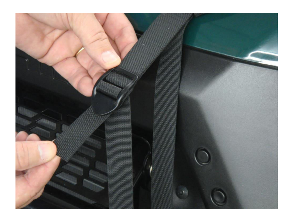
Step 5: With the enclosure properly aligned to the cab frame, tighten the front straps by pulling downward from the buckle on both strap ends at the same time as shown.