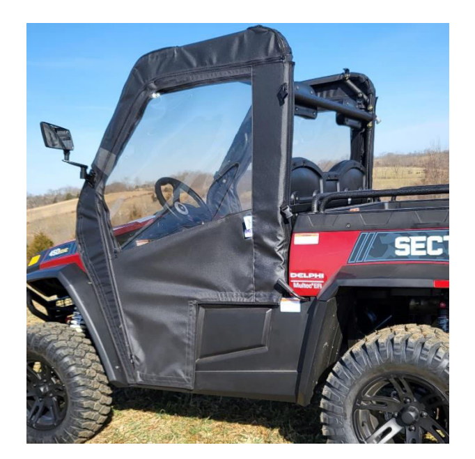
WRAP STRAPS AROUND THE ROLL BAR AND ATTACH TO ADHESIVE VELCRO THAT YOU HAVE PLACED BENEATH THE FRONT OF THE DOOR KIT.