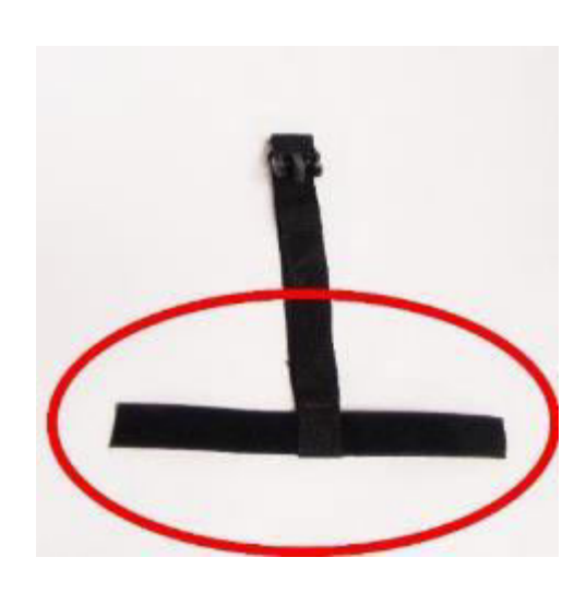
THE DOUBLE-SIDED STRAP IS CIRCLED YOU WILL CONNECT THIS STRAP TO THE VELCRO YOU INSTALL ON YOUR MACHINE