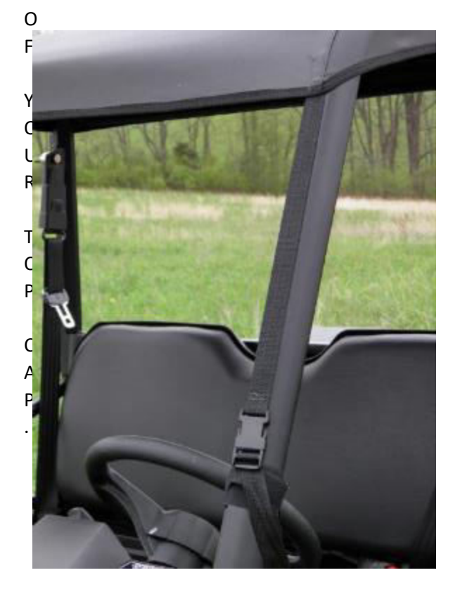
PICTURE SHOWS THE TENSION STRAPS ATTACHED TO YOUR TOP CAP. PULL THE TENSION STRAPS TO ADJUST THE POSITION