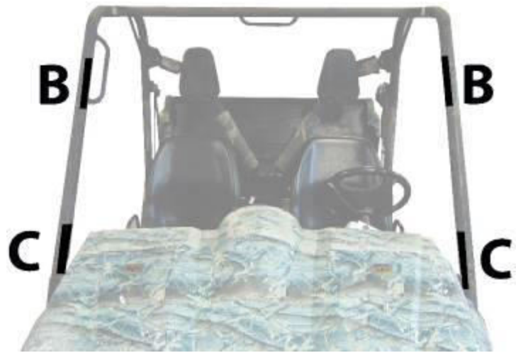
Figure 2: Place these strips more towards the inside of the roll bar. Tabs on the front of the door kit will wrap around the roll bar.