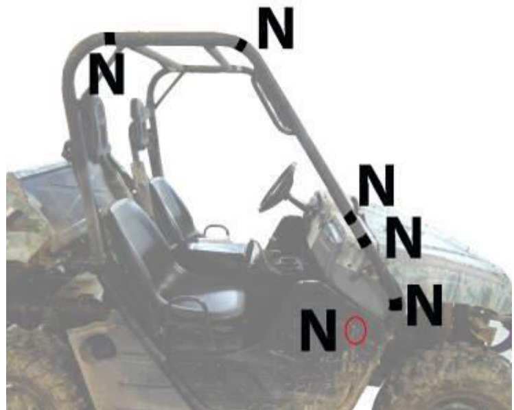
Figure 6: Adhesive strips N will wrap around the bar, the double sided tab for the red circle will not need adhesive Velcro. Wrap this tab around the hinge.