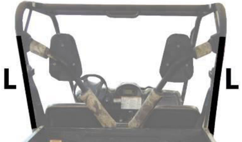
Figure 4: Shows placement of Velcro strips down the back of the roll bar. If you have a back panel the Velcro for this tab is sewn down the back of the back panel.