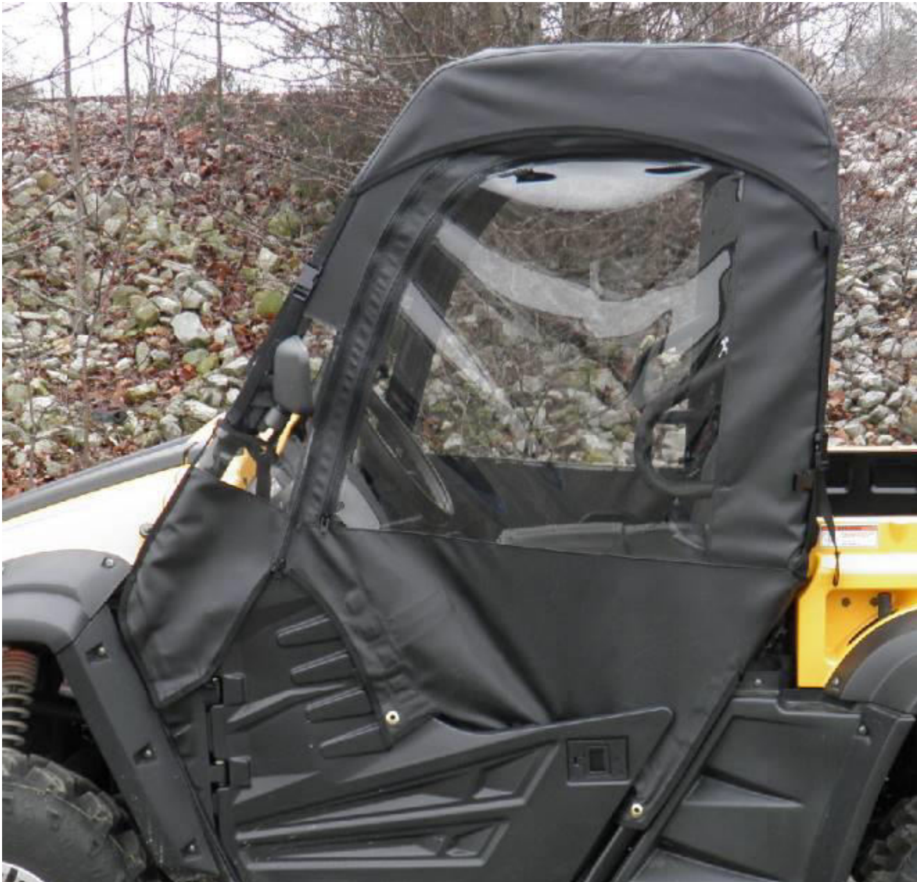
Figure 9: When the installation is complete your door kit should resemble the door kit in the photo.