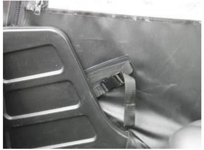
Figure 8: We have included a buckle that will secure the metal plate to the door. If the plate comes loose during use it will stay attached to the door.