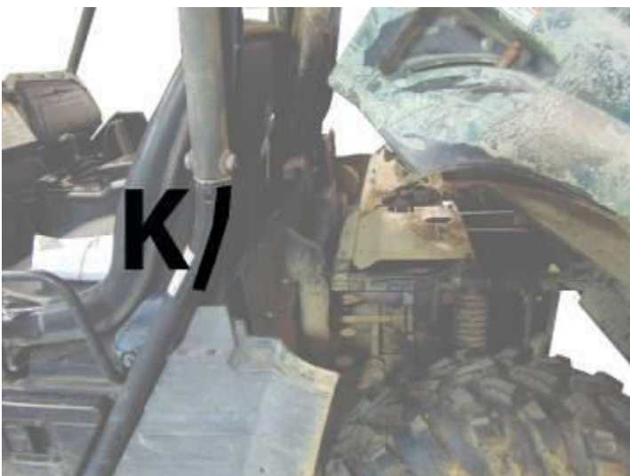
Figure 5: Raise the bed and attach to the bottom of the back roll bar.