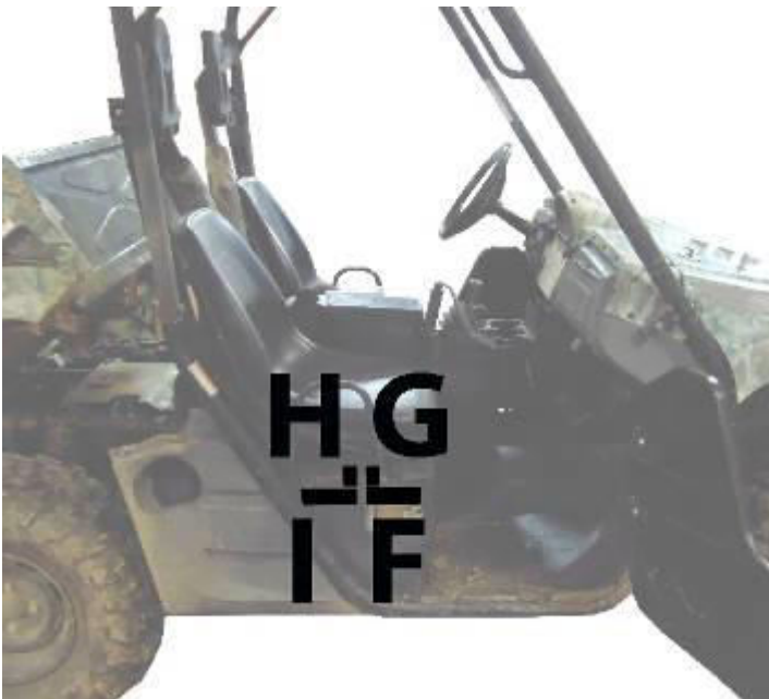
Figure 3: These strips are placed on the inside of the UTV.