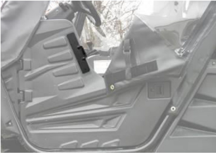
Figure 7: Metal plate has adhesive loop on the back that will attach to the adhesive hook placed on the outside of the factory door.