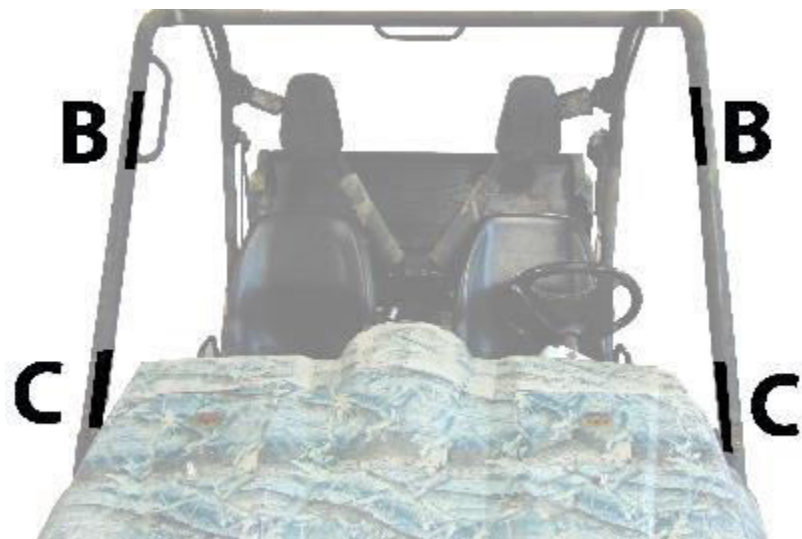
Figure 2: Place these strips more towards the inside of the roll bar. Tabs on the front of the door kit will wrap around the roll bar.