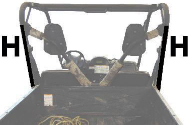
Figure 3: Shows placement of Velcro strips down the back of the roll bar. If you have a back panel the Velcro for this tab is sewn down the back of the back panel.