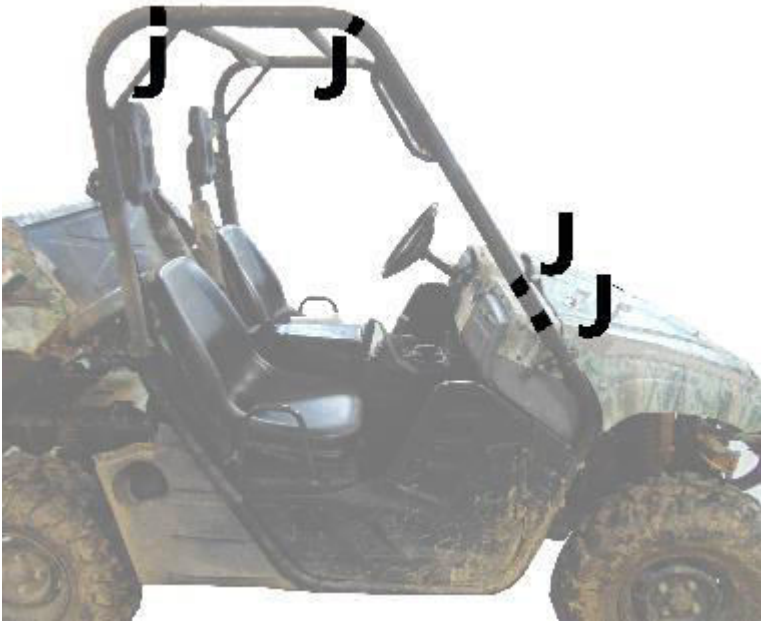
Figure 5: Adhesive strips J will wrap around the bar, The double sided tab on the window of the door kit is for the side grab bar, some UTV may not have this side grab bar.