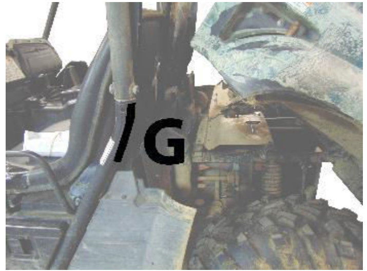
Figure 4: Raise the bed and attach to the bottom of the back roll bar.