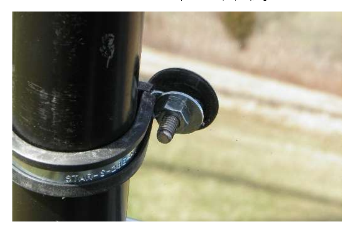
Step 5: To mount the upper windshield section, open 2 clamps and wrap around each of the front roll bars.

Step 6: Place the upper windshield section on the roll bars. The upper section should rest on the lower section as shown in the picture on the previous page. Install the clamps as indicated in step 3.