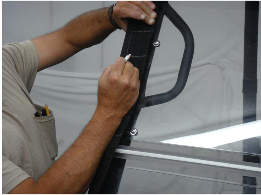
Mark windshield tabs where hard windshield clamps are located along the windshield Roll Bar