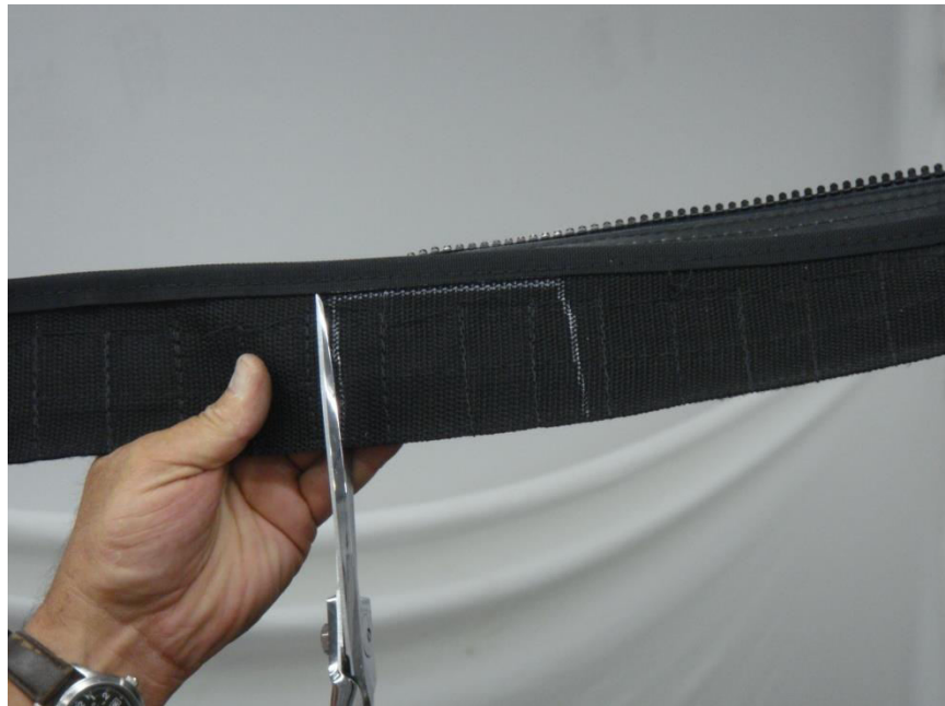
Cut the Tab being very careful not to cut the binding at the edge