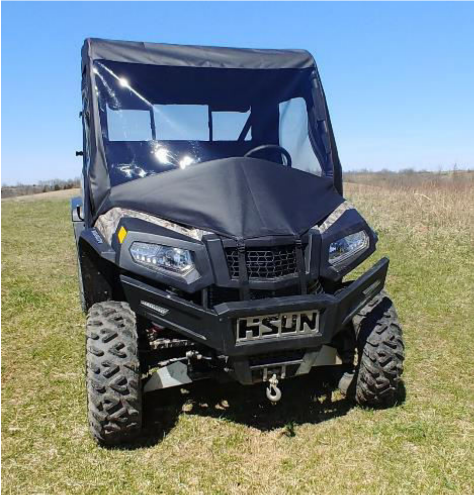
Figure 4: Loop center straps around the front fender and back through the buckle pull tight.