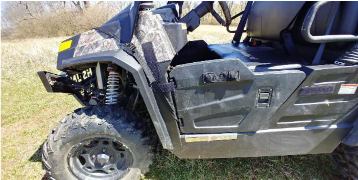
Figure 3: Loop strap around the bottom door hinge, back through the buckle and pull tight.