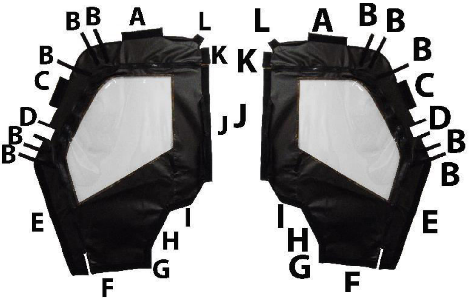
Passenger Side (Inside)

Pictures show the sewn on Velcro tabs and straps that correspond to the Velcro chart.