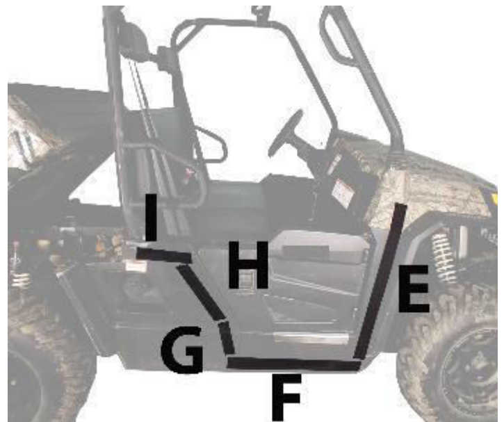
Figure 4: Shows placement of Velcro strips E, F, G, H, AND I.