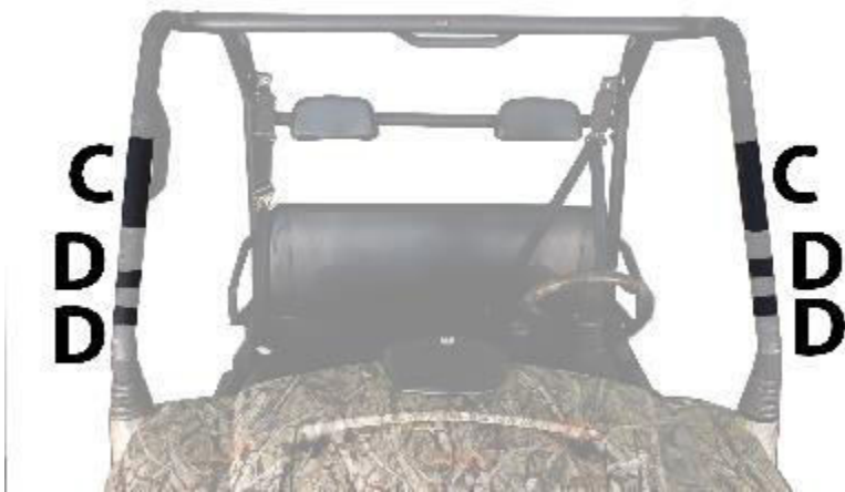
Figure 3: Shows placement of Velcro strips C and D. The tabs on the front of your doors will wrap around the front of the roll bar and attach to the Velcro strip.