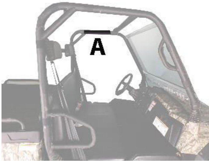
Figure 1: Shows placement of Velcro strips A, place on the top roll bar toward the interior of the cab.