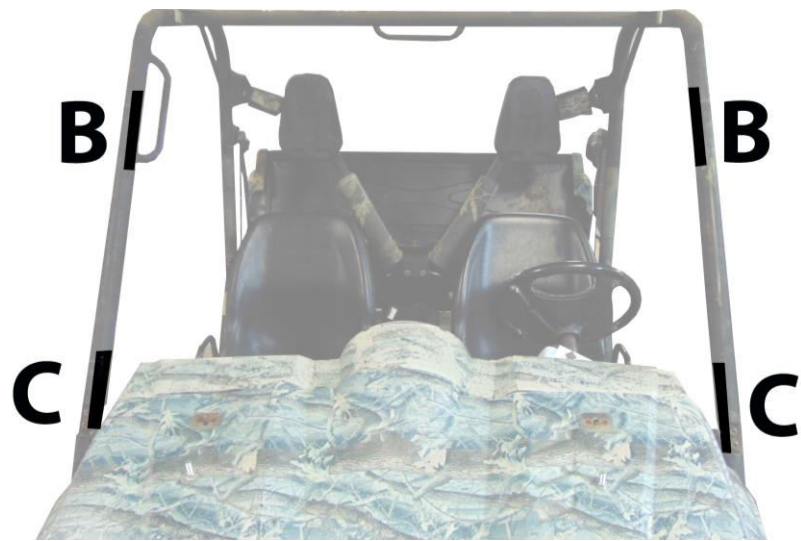
Figure 2: Place these strips more towards the inside of the roll bar. Tabs on the front of the door kit will wrap around the roll bar.