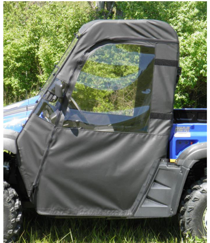
Figure 6: When the install is complete your door should resemble the door in the photo.