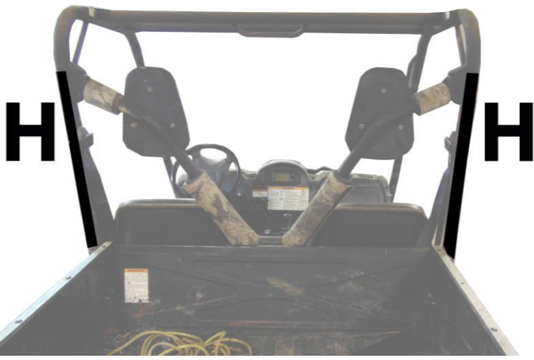
Figure 3: Shows placement of Velcro strips down the back of the roll bar. If you have a back panel the Velcro for this tab is sewn down the back of the back panel.