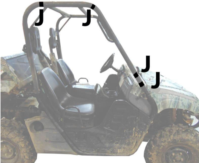
Figure 5: Adhesive strips J will wrap around the bar, The double sided tab on the window of the door kit is for the side grab bar, some UTV may not have this side grab bar.