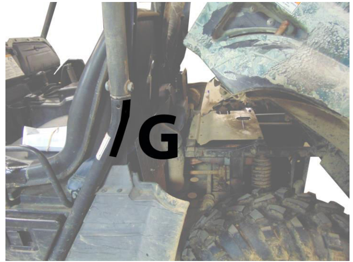
Figure 4: Raise the bed and attach to the bottom of the back roll bar.