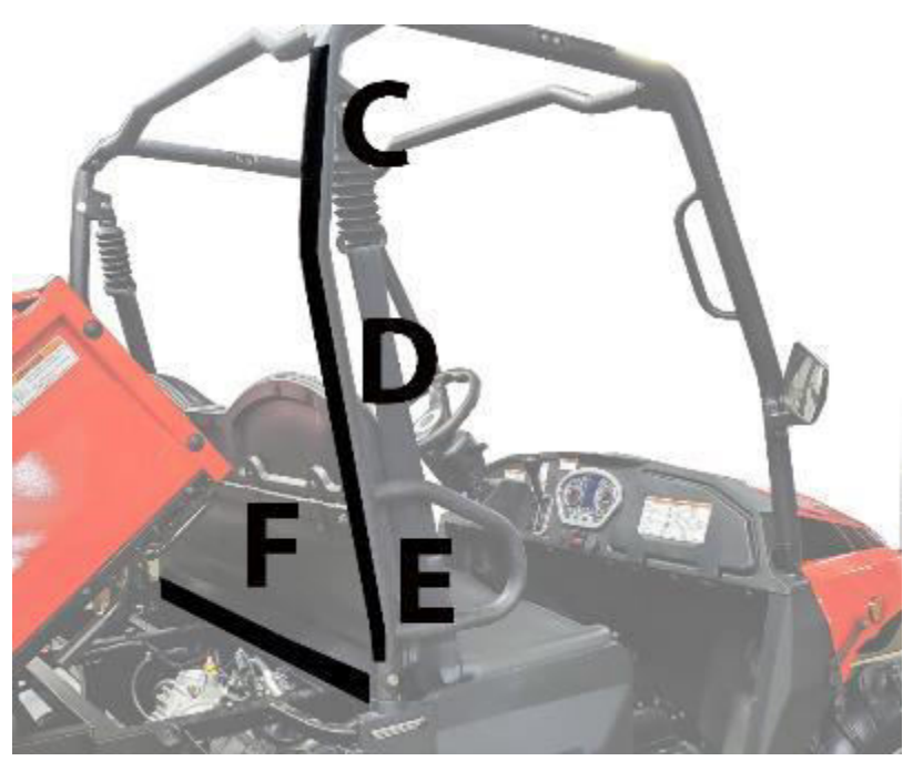
Figure 2: These strips are placed on the back roll bar facing the bed, strip F may be cut in to two or three pieces for easier install.