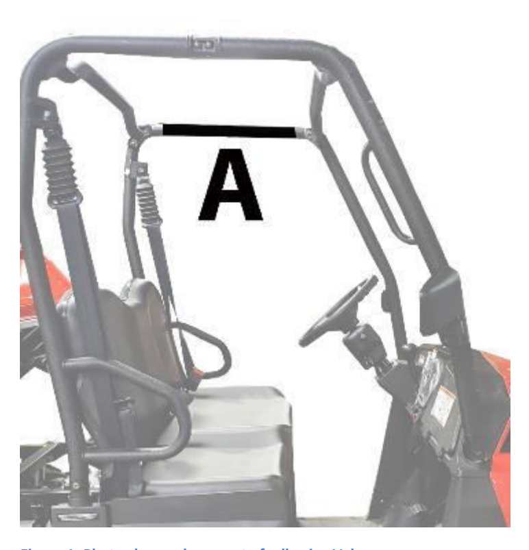
Figure 1: Photo shows placement of adhesive Velcro.