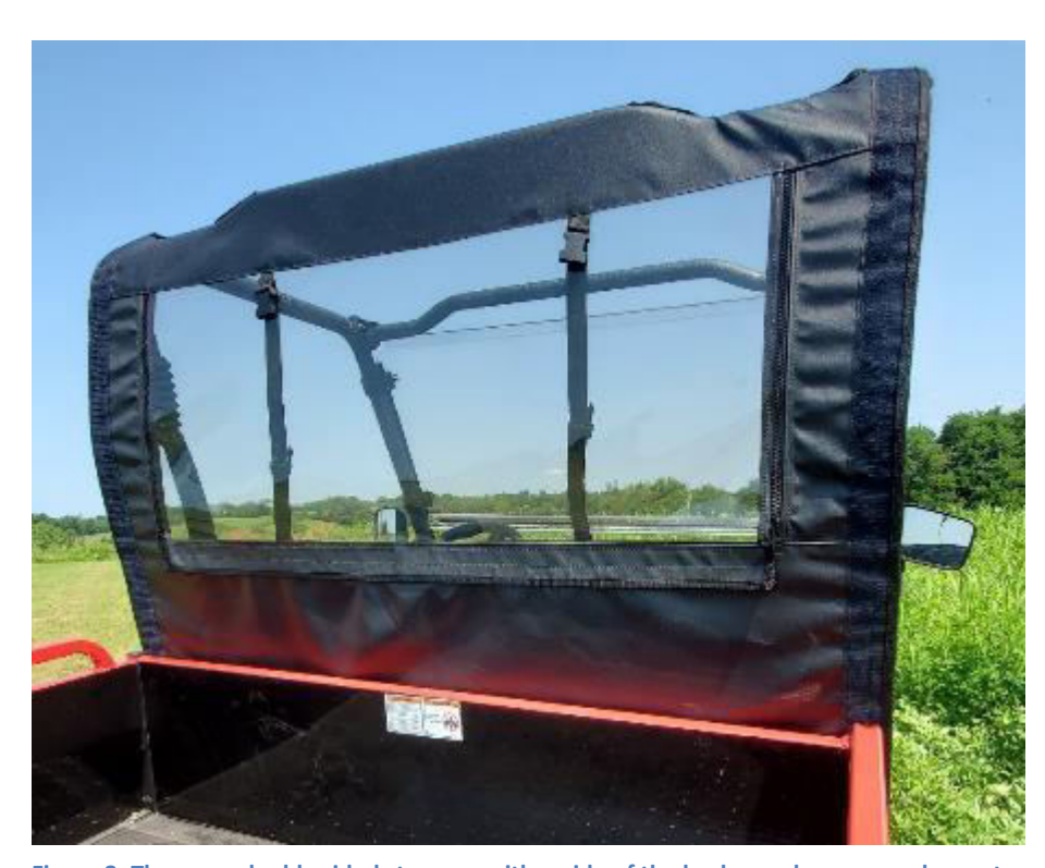
Figure 3: There are double sided straps on either side of the back panel, you may choose to use Velcro here for extra hold but this is not necessary. Wrap these strips around the bar and attach double sided straps.