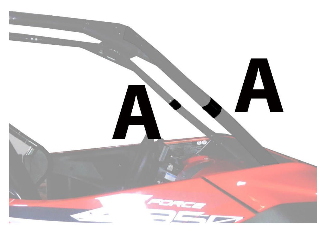
Figure 1: WRAP THESE VELCRO STRIPS AROUND THE ROLL BAR AND ATTACH DOUBLE-SIDED STRAP.