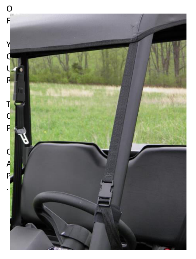
PICTURE SHOWS THE TENSION STRAPS ATTACHED TO YOUR TOP CAP. PULL THE TENSION STRAPS TO ADJUST THE POSITION