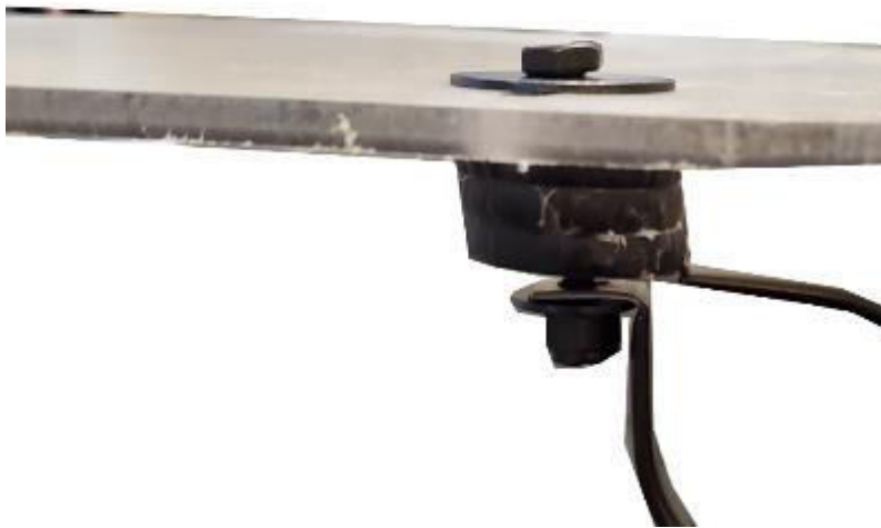
Photo to left shows the order of hardware. Bolt, large washer on top, through lexan, 3 spacers on the flat part of the loop clamp, with small washer and lock nut on the bottom.

Attach loop clamp to roll bar open end facing the inside of the utv. Flat side facing up. Drill through the top of the lexan and through the hole in the loop clamps. stack three lexan spacers between the hard top and the loop clamp. Insert bolt and large washer through the top of the lexan and through the spacers and through the hole in the loop clamps. Secure with small washer and lock nut.