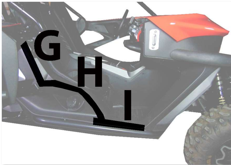
Figure 5: SHOWS PLACEMENT OF VELCRO STRIPS (G, H AND I) STRIP H MAY NEED TO BE TRIMMED IN ORDER TO FOLLOW THE CURVE OF THE UTV.