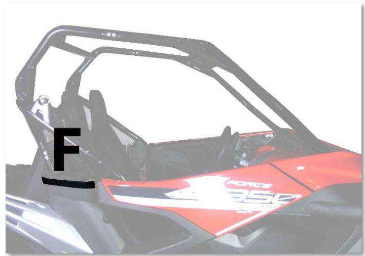
Figure 4: SHOWS PLACEMENT VELCRO STRIPS (F)