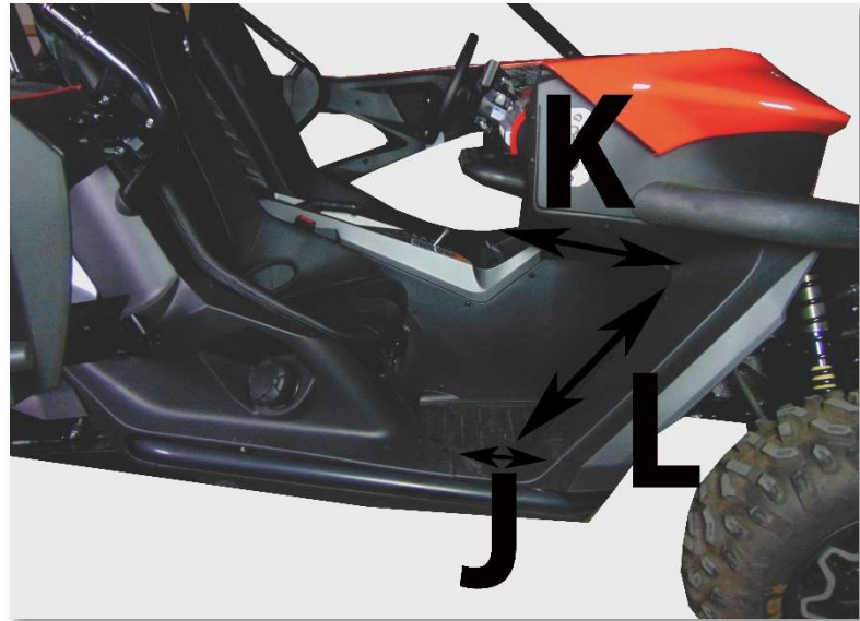
Figure 6: SHOWS PLACEMENT OF VELCRO STRIPS (J, K AND L) THE ADHESIVE VECLRO WILL BE PLACED ON THE INSIDE OF THE UTV