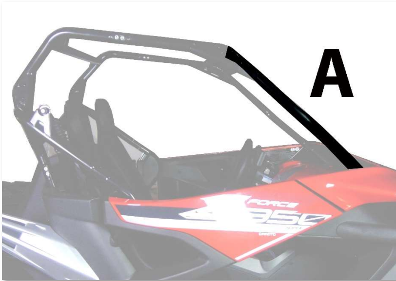
Figure 1: SHOWS PLACEMENT OF VELCRO STRIPS (A) Velcro straps on the door will wrap around the roll bar and attach to the same adhesive strip A.