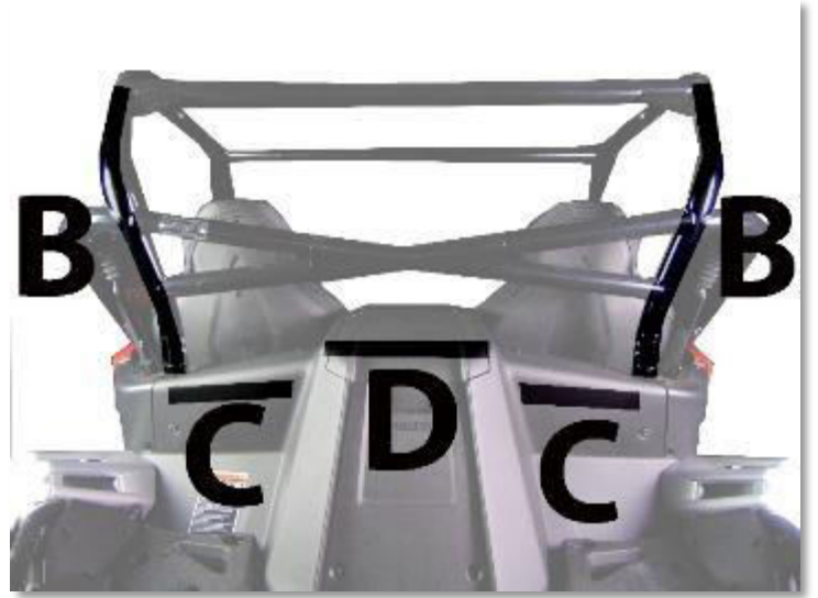
Figure 2: SHOWS POSITION OF VELCRO STRIPS (B, C, AND D),