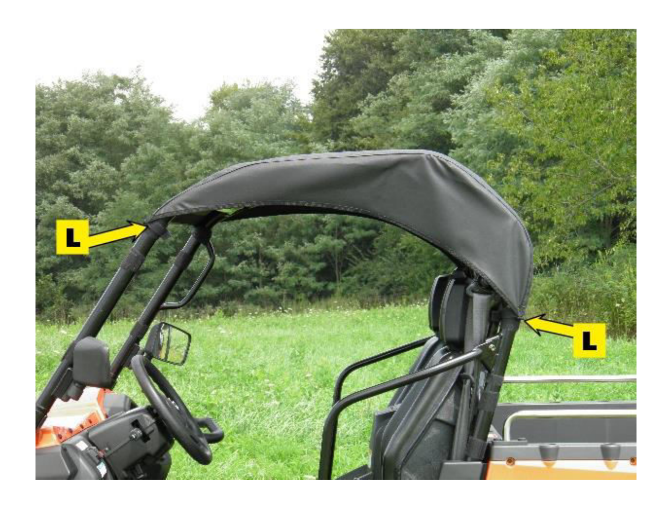
Step 3: After all adhesive hook strips are attached, begin attaching the enclosure to the cab frame. As you attach the hook and loop, square each panel to the frame. PLEASE NOTE, FOR MAXIMUM ADHESION, ALLOW THE ADHESIVE HOOK TO ADHERE TO THE FRAME FOR 24 HOURS BEFORE PULLING AGAINST THE HOOK WITH THE LOOP STRIPS.

Step 4 : Repeat any steps necessary to achieve a snug fit on the cab frame.