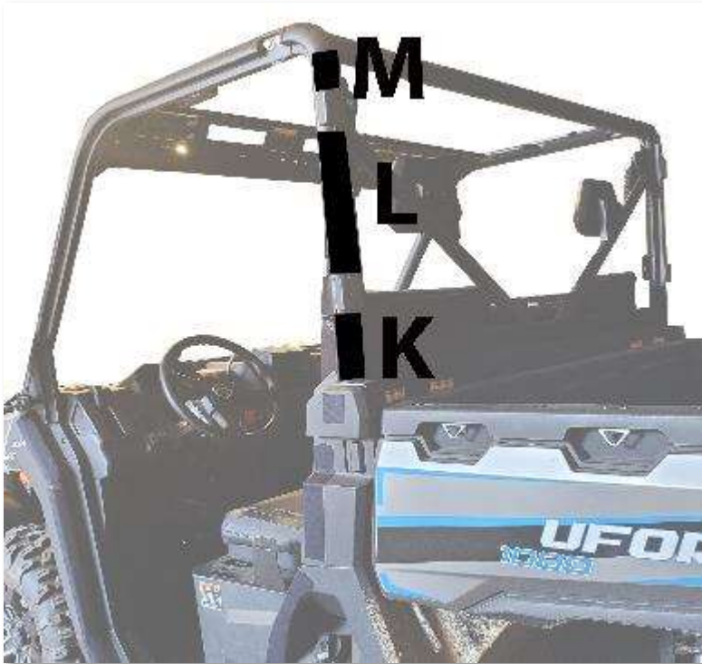
Figure 5: SHOWS PLACEMENT OF VELCRO STRIPS (G, H AND I) STRIP H MAY NEED TO BE TRIMMED IN ORDER TO FOLLOW THE CURVE OF THE UTV.