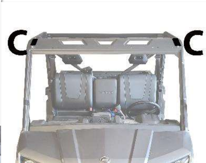
Figure 2: SHOWS PLACEMENT OF VELCRO STRIPS C.