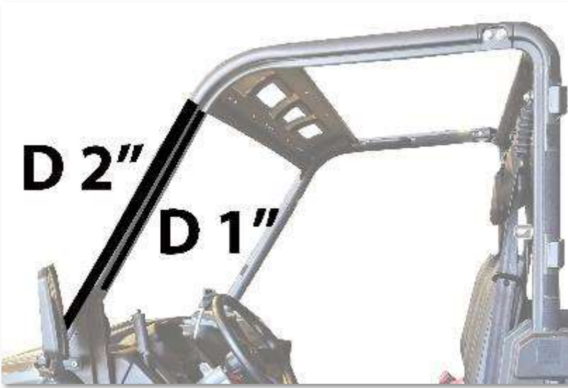
Figure 3: SHOWS PLACEMENT OF VELCRO STRIPS D.