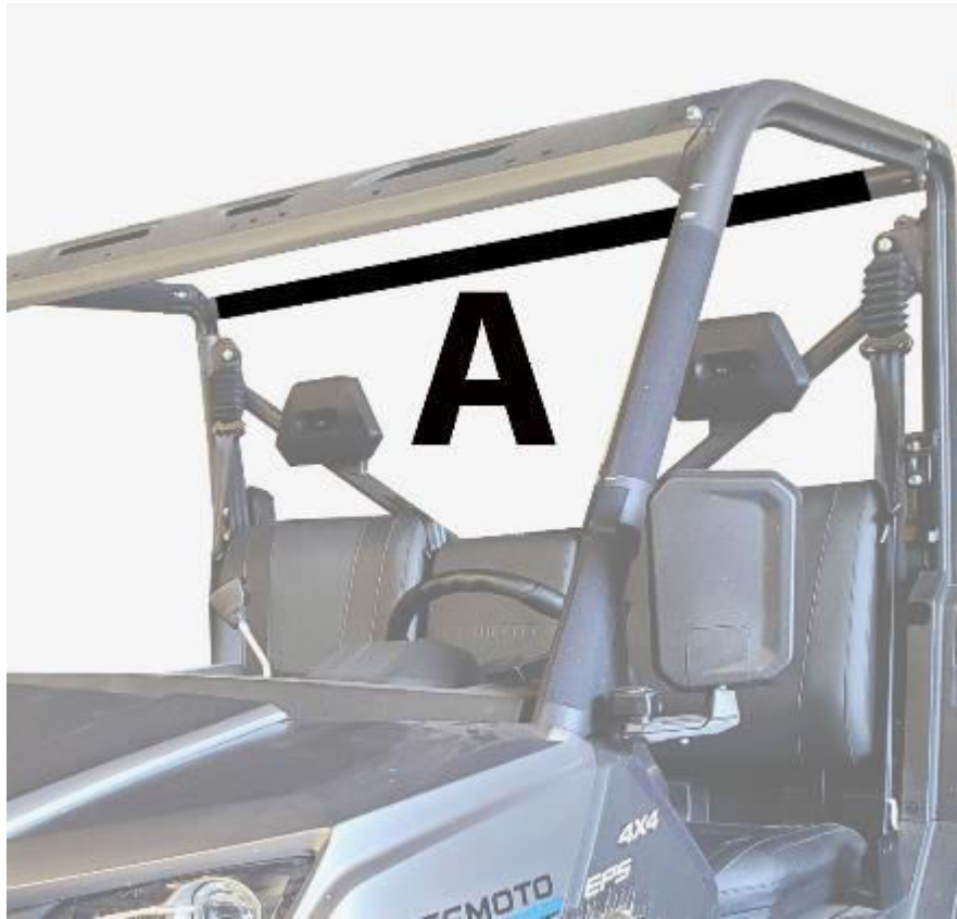
Figure 1: Pull back panel up and over the top roll bar, attach to strip A.