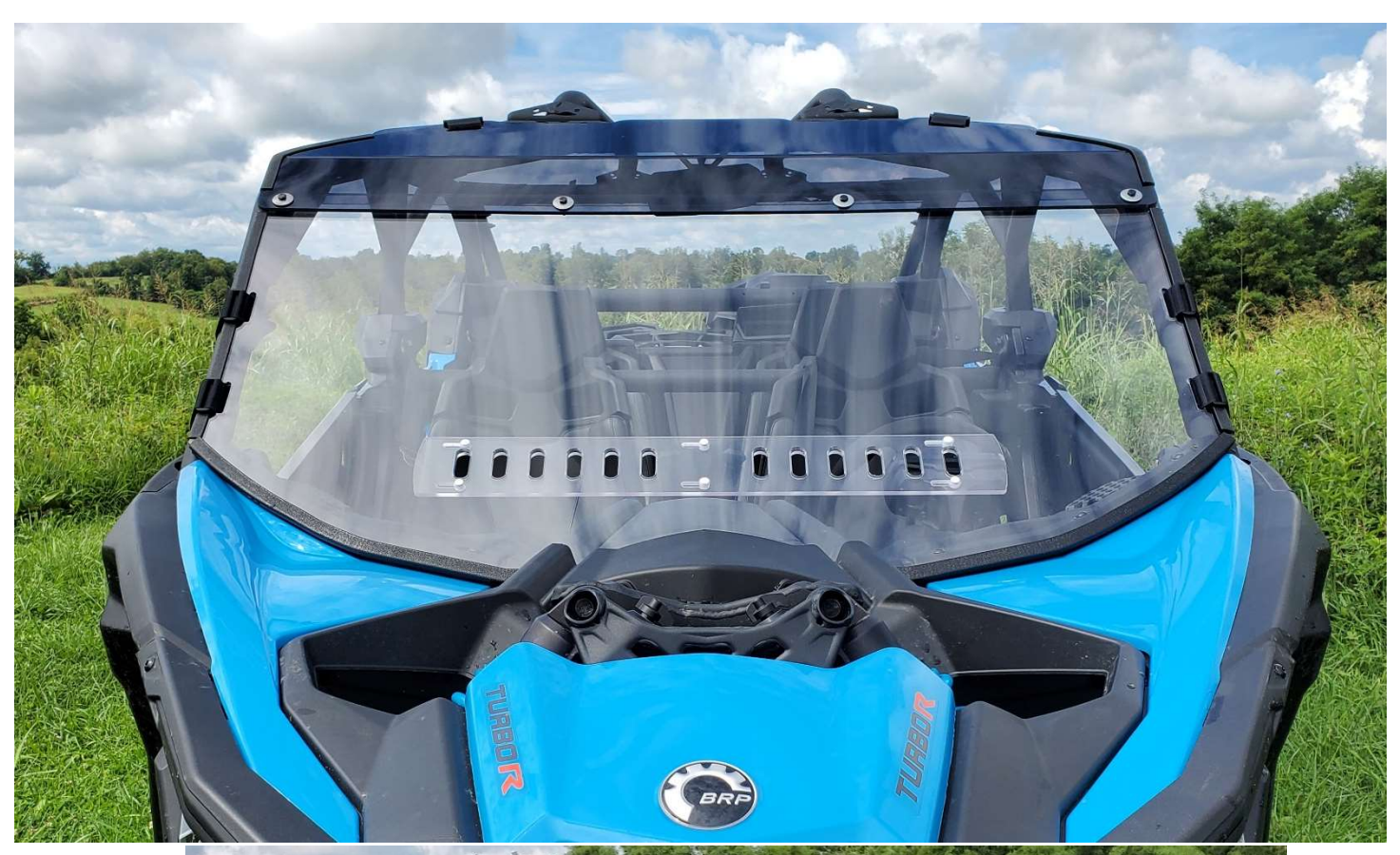
STEP 6: Once you have installed all straps you may remove the protective paper from both sides of the windshield.