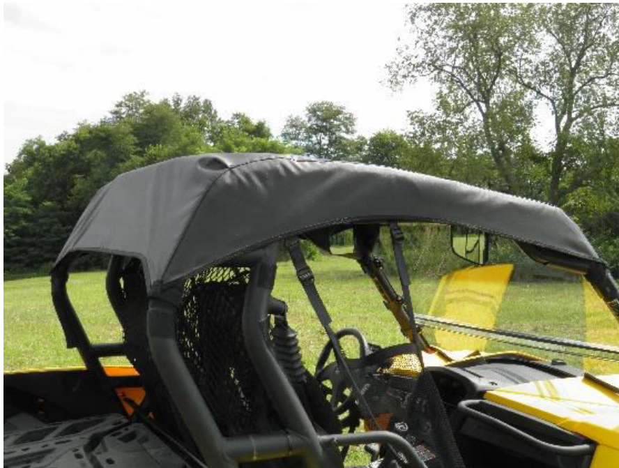
Figure 5.1 - re-tighten each Velcro Tab until the Top Cap is tight on all sides and no major wrinkles are showing.

Step 5: Repeat step 4 pulling downward firmly and re-attaching each of the Velcro Tabs until the Top Cap is tight and there are no wrinkles in the Top Cap Enclosure as shown in figure 5.1